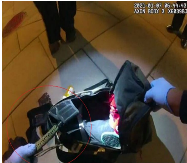
Figure 17: Officer-3 BWC