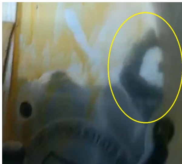
Figure 8: Officer-1 BWC