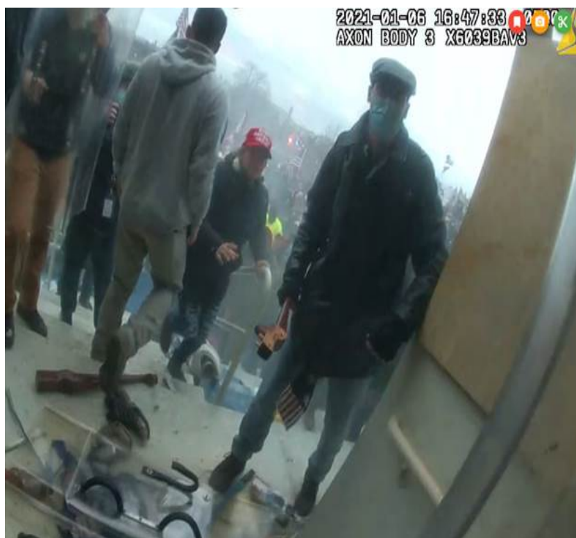
Figure 10: Officer-2 BWC

Near the time of the assault, Officer-1 was standing in close proximity to Officer-2. A review of Officer-2's BWC revealed DESJARDINS approaching the officers a second time with the broken table leg.