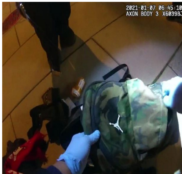
Figure 19: Officer-3 BWC