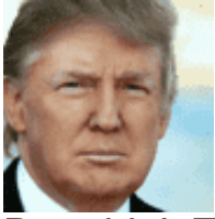
Donald J. Trump 45th President of the United States