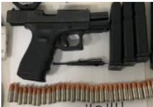
Exhibit A – Images of evidence recovered during arrest of Tuckson on March 6, 2022