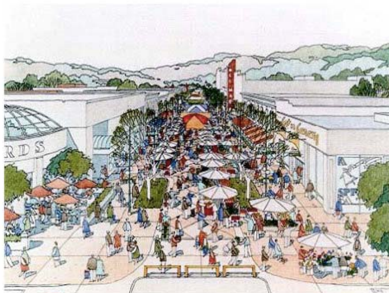
... will be transformed once a week into a Farmers Market. ... can be transformed for special occasions and events.