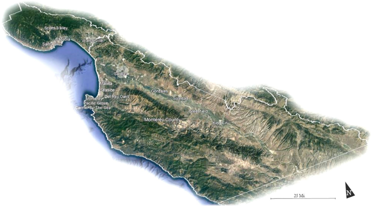
Figure 1: Map of AMBAG RHNA Area

Marina, Seaside, Sand City, Monterey, Pacific Grove, Carmel, and the County of Monterey. Also affected are the unincorporated communities of Aptos, Live Oak, Moss Landing, and Pebble Beach.