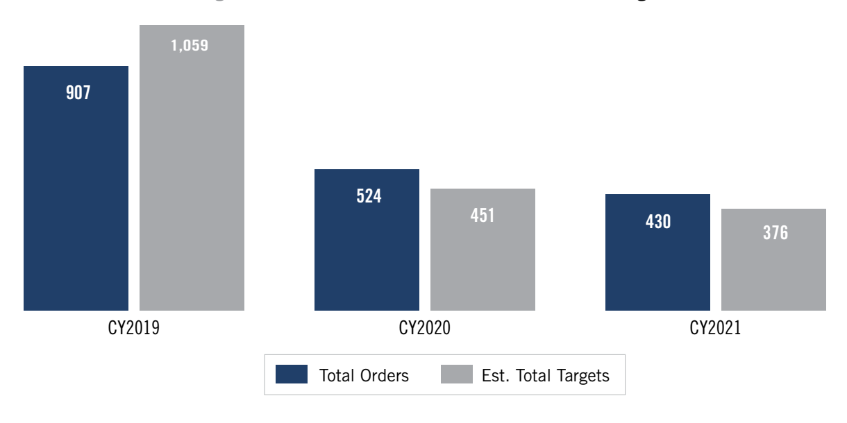
Figure 1: FISA "Probable Cause" Court Orders and Targets

HOW ORDERS ARE COUNTED. The number of court orders is not dependent on the number of targets authorized in a single order, nor is it reduced if the court order concerns a target for whom a prior order has been obtained by the government. As such, four orders authorizing collection on a single target are counted as four orders. Alternatively, one order authorizing collection on four targets is counted as a single order.