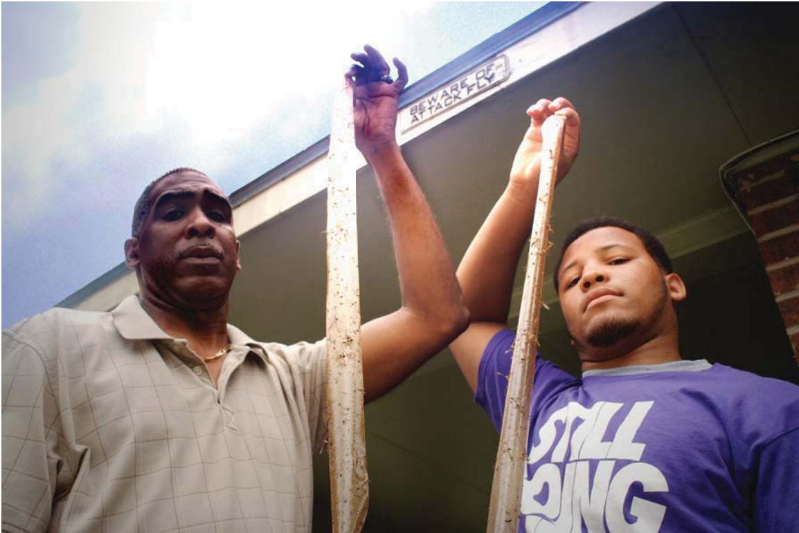
Showing sewer flies