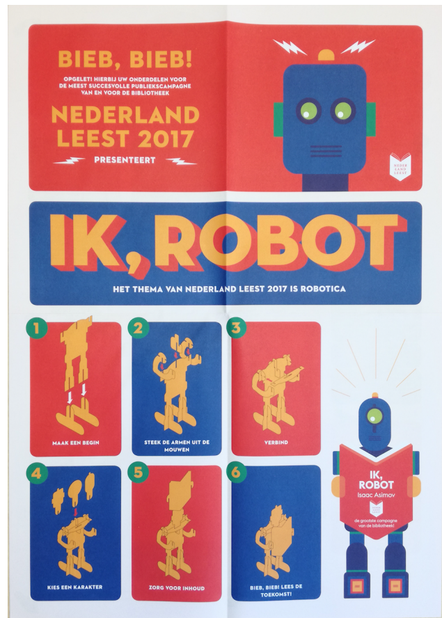
Figure 1: Make-it-yourself cardboard robot. Promotional material distributed as part of the 2017 ‘Nederland leest!’ campaign by the CPNB on robotics and books.

The CPNB wanted to encourage debate about the role of AI and robotics in literature through the addition of a 10th short story co-created by an established fiction writer and a machine. An award-winning Dutch author, Ronald Giphart, agreed to take part in this experiment.