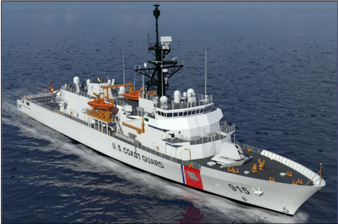
Figure 3. Offshore Patrol Cutter Artist's rendering

Source: Photograph accompanying Kirk Moore, "Coast Guard's Birthday Present: Naming the Next Cutters," WorkBoat , August 4, 2017. A caption to the rendering credits the rendering to Eastern Shipbuilding Group.