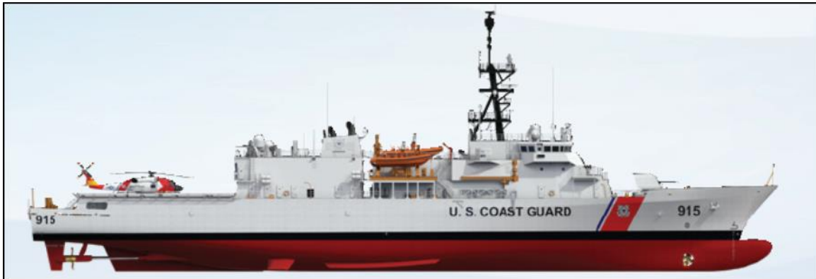
Figure 4. Offshore Patrol Cutter Artist's rendering