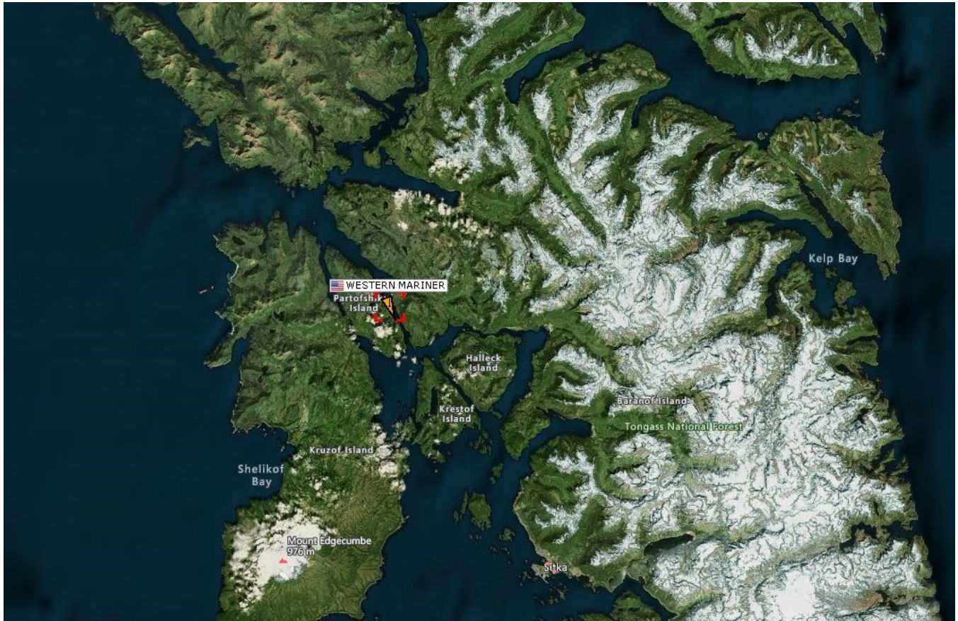
Figure 2. Incident Location.