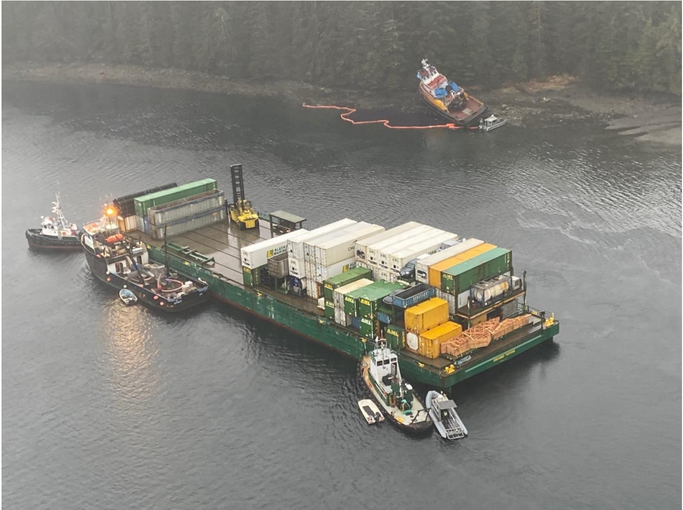
Figure 4. Barge and grounded vessel around 8:00 am on March 21 st as crew work to boom the vessel.