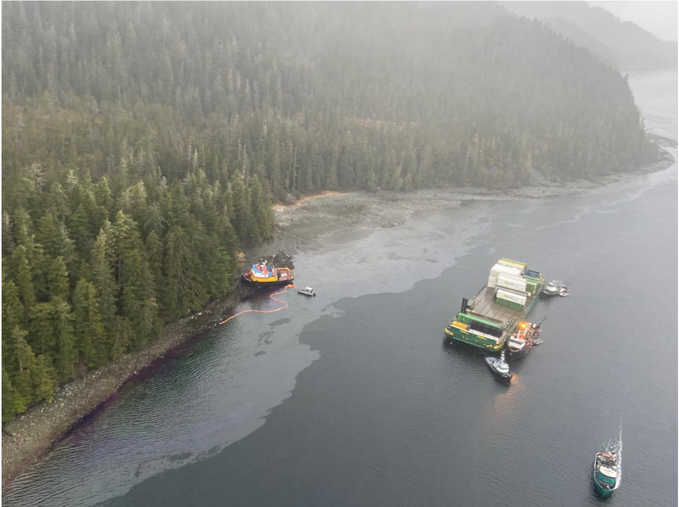
Figure 10. Observed sheening as seen around 8:00 am on March 21 st as crew work to boom the vessel.

AGENCY/STAKEHOLDER NOTIFICATION LIST: This situation report was distributed to the agencies listed on the standard distribution list, which includes the governor’s office, State Emergency Operations Center, U.S. Department of the Interior, National Marine Fisheries Service, U.S. Fish and Wildlife Service, and other state agencies. This situation report was also distributed to the following agencies and stakeholders: