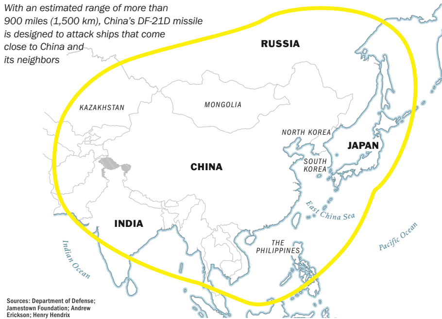
Sources: Department of Defense; Jamestown Foundation; Andrew Erickson; Henry Hendrix

With an estimated range of more than 900 miles (1,500 km), China’s DF-21D missile is designed to attack ships that come close to China and its neighbors