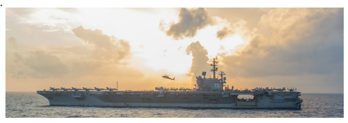
An MH-60R Sea Hawk helicopter prepares to land on the flight deck of the Nimitz-class aircraft carrier USS Ronald Reagan (CVN 76) during routine flight operations.