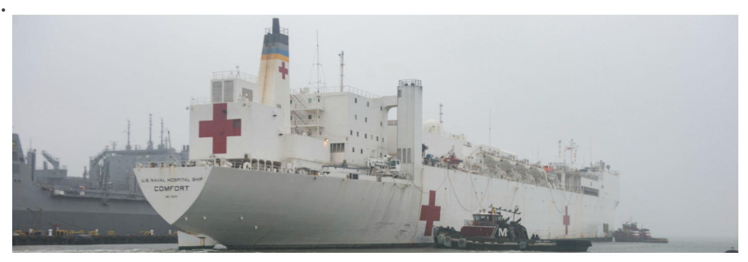
The Military Sealift Command hospital ship USNS Comfort (T-AH-20) prepares to depart Naval Station Norfolk in preparation for Hurricane Joaquin.

Notice: As a result of increases in the Health Protection Condition (HPCON) level, our offices are limited to mission-essential personnel only and maximizing the use of telework for other personnel. This means that we are unable to handle requests sent via traditional methods and can only respond to electronic inquiries while under elevated HPCON levels