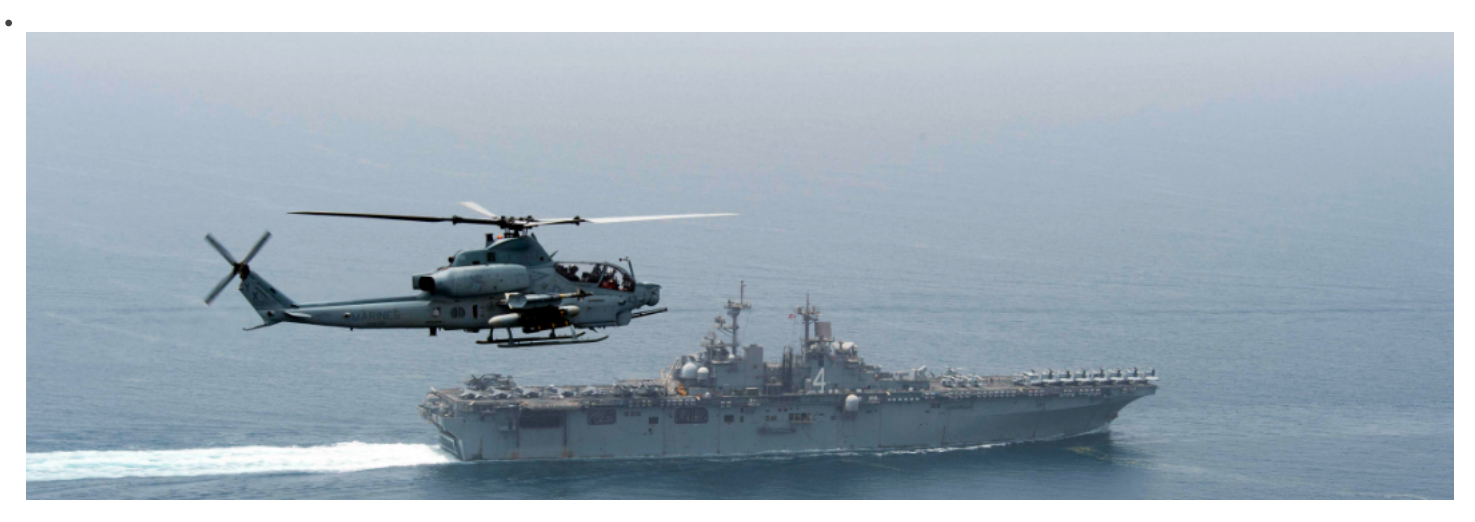
An AH-1Z Viper helicopter, assigned to the 13th Marine Expeditionary Unit (MEU), patrols waters near the amphibious assault ship USS Boxer (LHD 4).