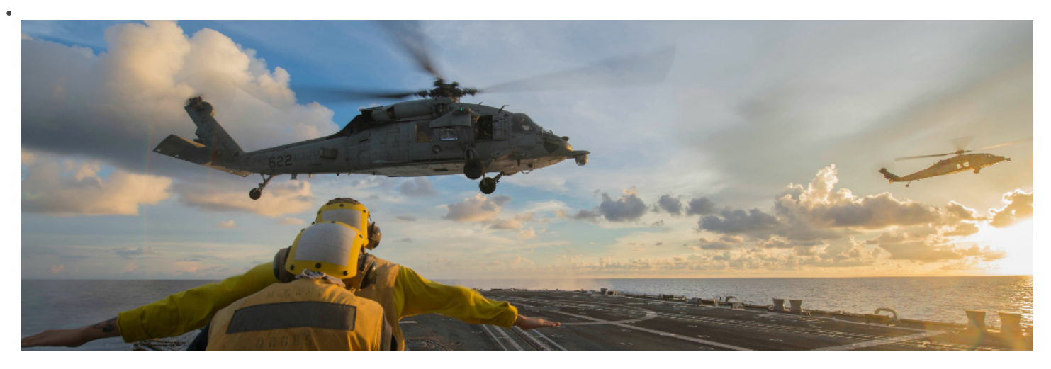
Sailors signal to an MH-60S Sea Hawk helicopter attached to the Golden Falcons of Helicopter Sea Combat Squadron (HSC) 12 as it hovers over the flight deck of the Arleigh-Burke-class guided-missile destroyer USS McCampbell (DDG 85).