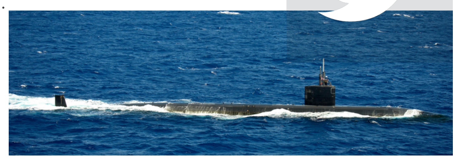
Los Angeles-class fast-attack submarine USS Cheyenne (SSN 773) transits in close formation as one of 40 ships and submarines representing 13 international partner nations during Rim of the Pacific 2016.