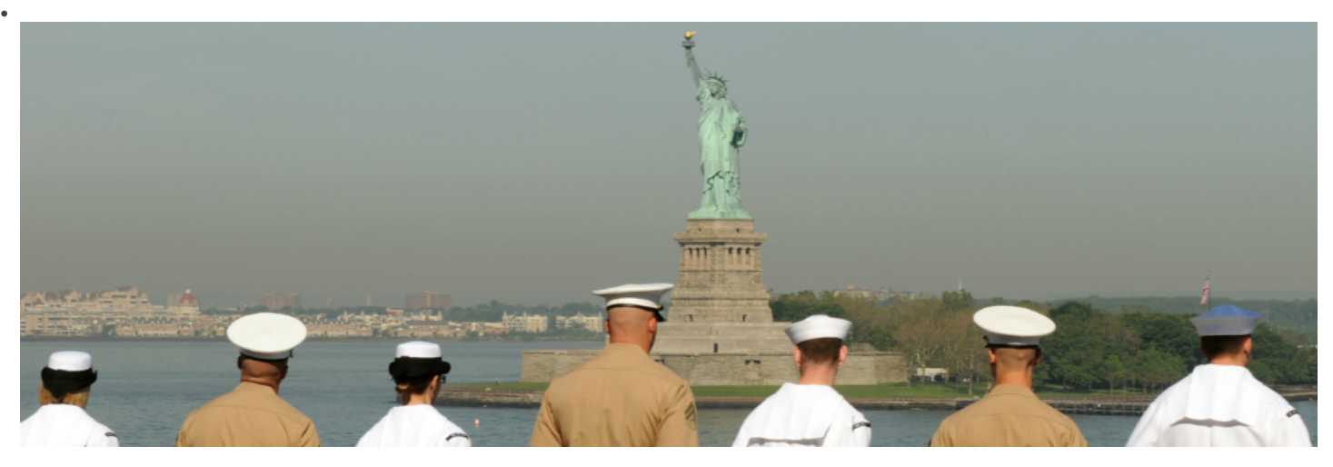
Sailors and Marines man the rails as the multi-purpose amphibious assault ship USS Iwo Jima (LHD7) passes by the Statue of Liberty.