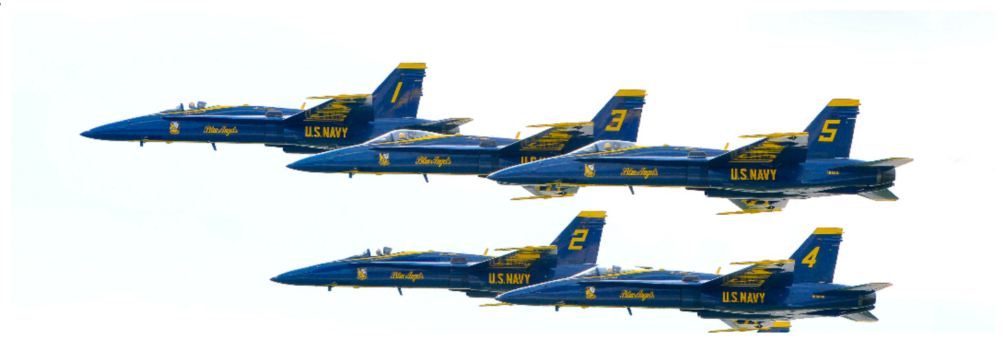
U.S. Navy Flight Demonstration Squadron, the Blue Angels, Delta Pilots fly in formation at Air Power Expo.