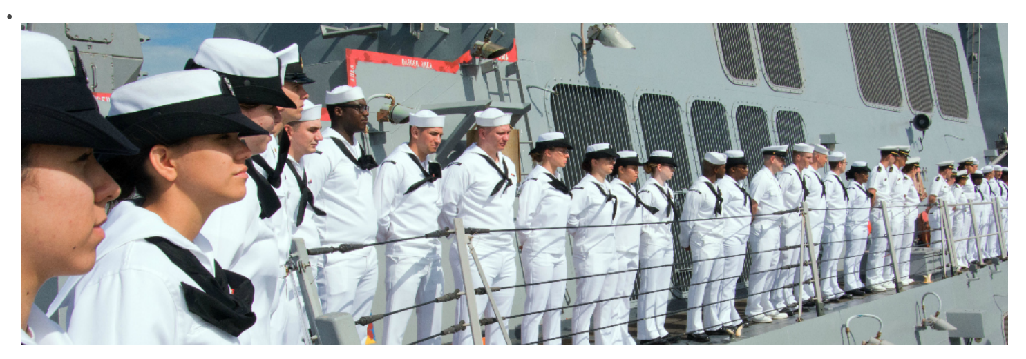
Sailors aboard the guided-missile destroyer USS Mason (DDG 87) man the rails as Mason departs Naval Station Norfolk.