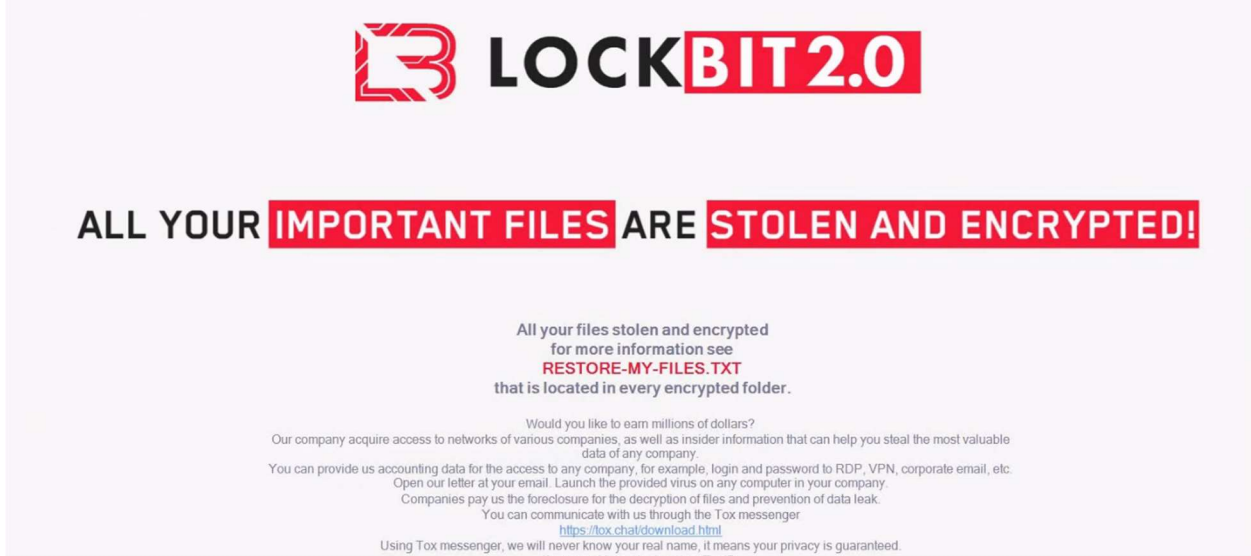
Figure 4 - Wallpaper