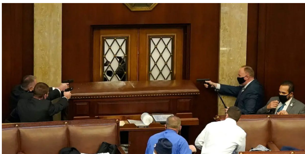
Figure 10 8