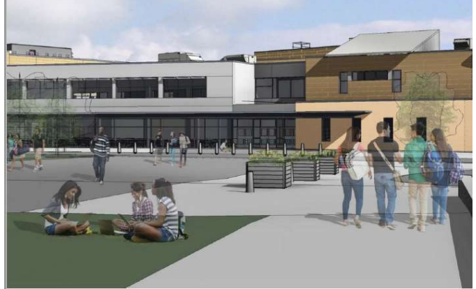
New Building Schematic