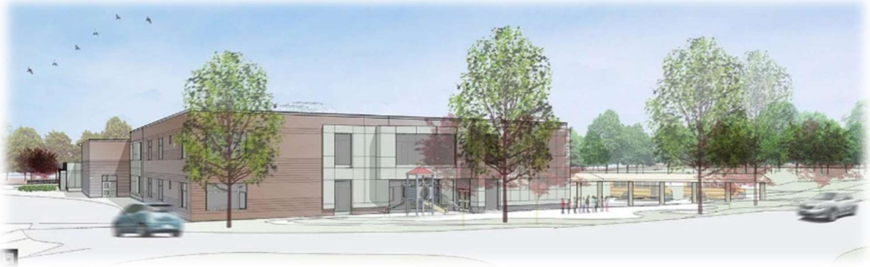
Nelson Place School ( Opened August 2017 )

Nelson Place School – Major Renovation or Replacement Project