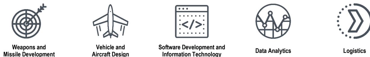
Figure 1. Targeted Industries