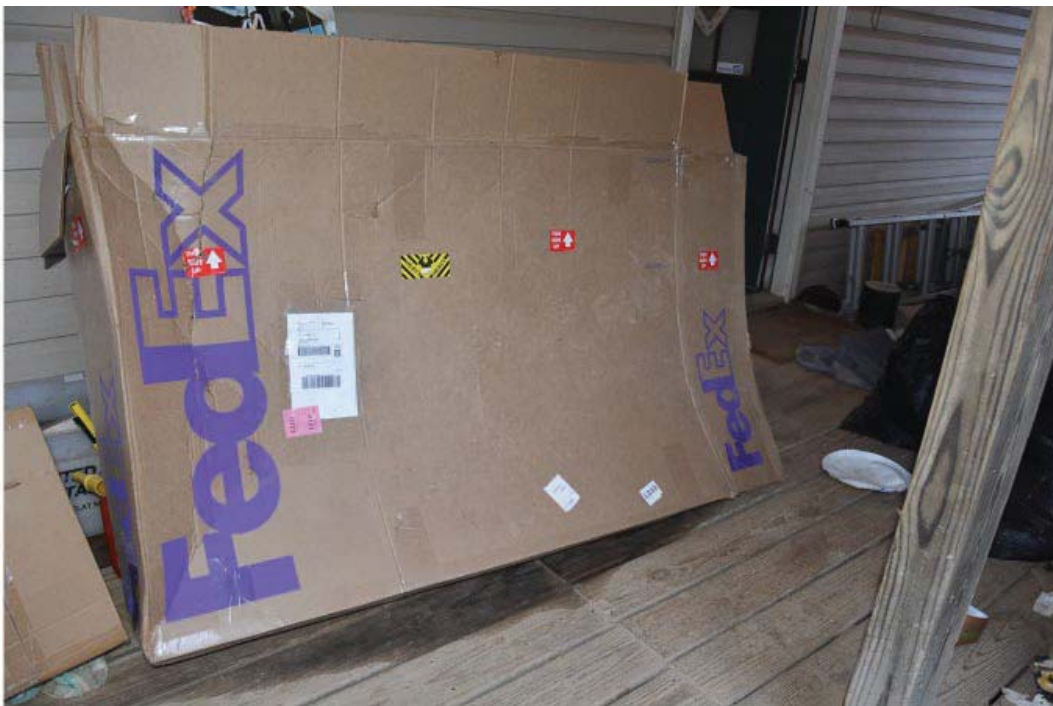
(FEDEX Box on porch of 1285 Sweet Home Road, Cumberland Furnace, Tennessee on January 11, 2021)