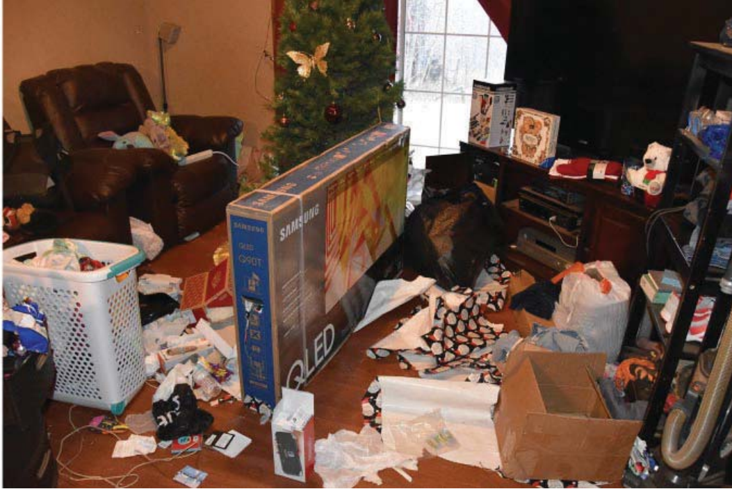
(Living Room of 1285 Sweet Home Road, Cumberland Furnace, Tennessee on January 11, 2021)

Agents conducting the search of Lopez's residence located a tan colored satchel. Inside the satchel agents found a Smith and Wesson Model 4506 .45 caliber handgun bearing serial number VAS0598. Also located in the bag, agents recovered an unopened can of Red Bull energy drink and two DVDs (see below). Your Affiant believes the Red Bull and DVDs were purchased by Lopez on October 8, 2020 at Pilot Travel Centers truck stop located at 3400 Service Loop Road, West Memphis, Arkansas while he was in route to Dallas, Texas.