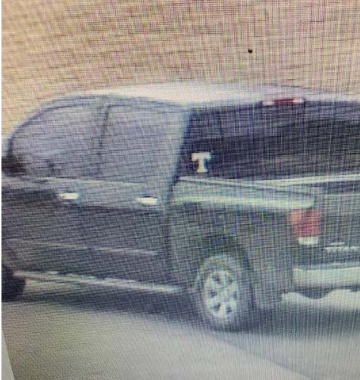
(Lopez's vehicle departing Pilot Travel Centers (#60700) truck stop located at 3400 Service Loop Road, West Memphis, Arkansas on October 8, 2020)

At 5:02 pm on October 8, 2020, Lopez made an ATM withdraw using his debit card in West Memphis, Arkansas in the amount of $100 (plus a $3.95 service charge). Seven minutes later (5:09 pm), Lopez's debit card was used at a Flying J Truck Stop in