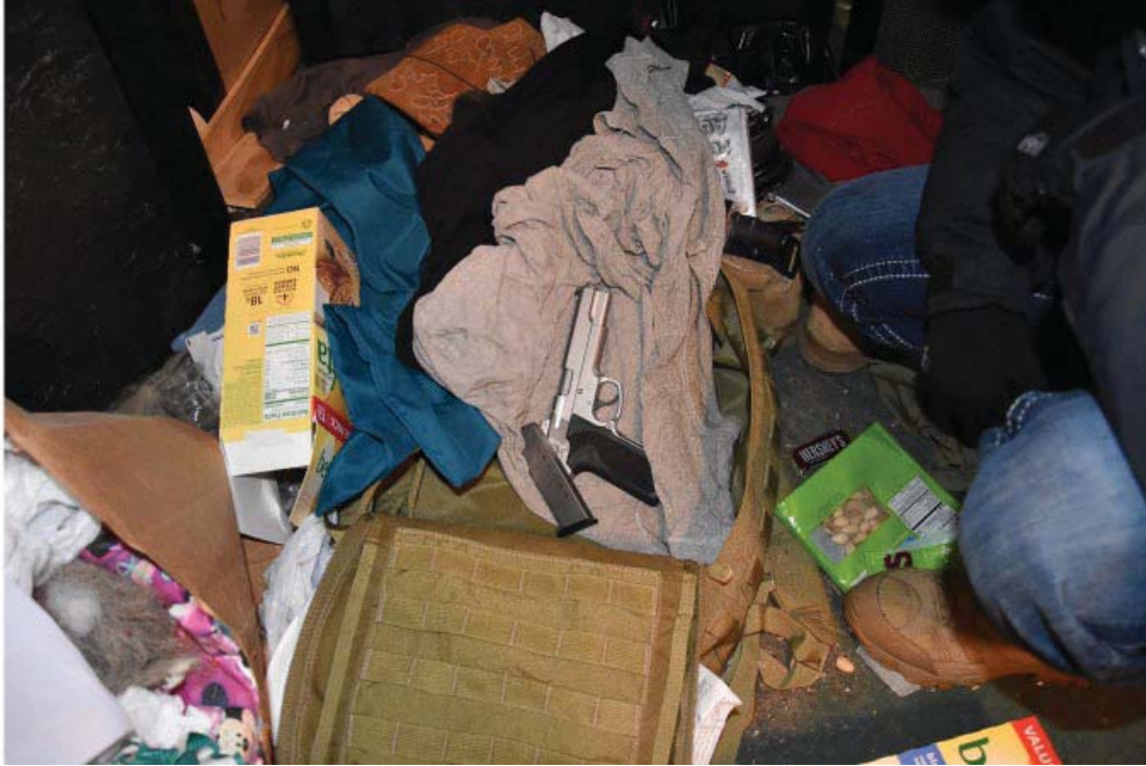
(Photo taken January 11, 2021 inside 1285 Sweet Home Road, Cumberland Furnace, Tennessee)