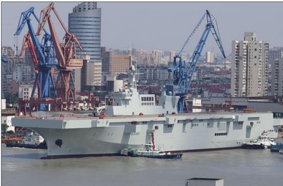
Figure 21. Type 075 Amphibious Assault Ship