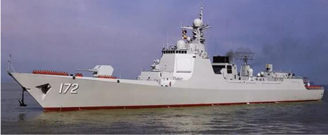
Figure 17. Luyang III (Type 052D) Destroyer