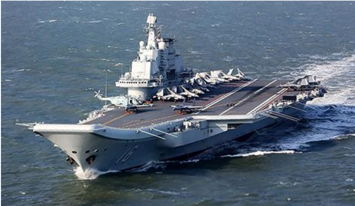
Figure 10. Liaoning (Type 001) Aircraft Carrier