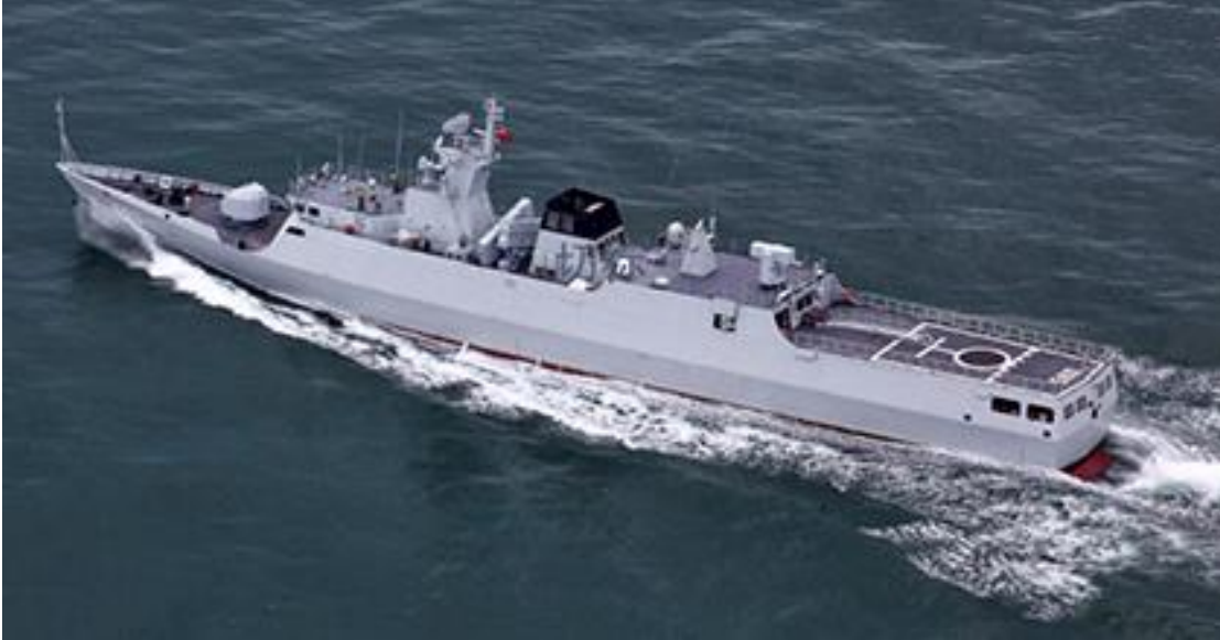
Figure 19. Jingdao (Type 056) Corvette