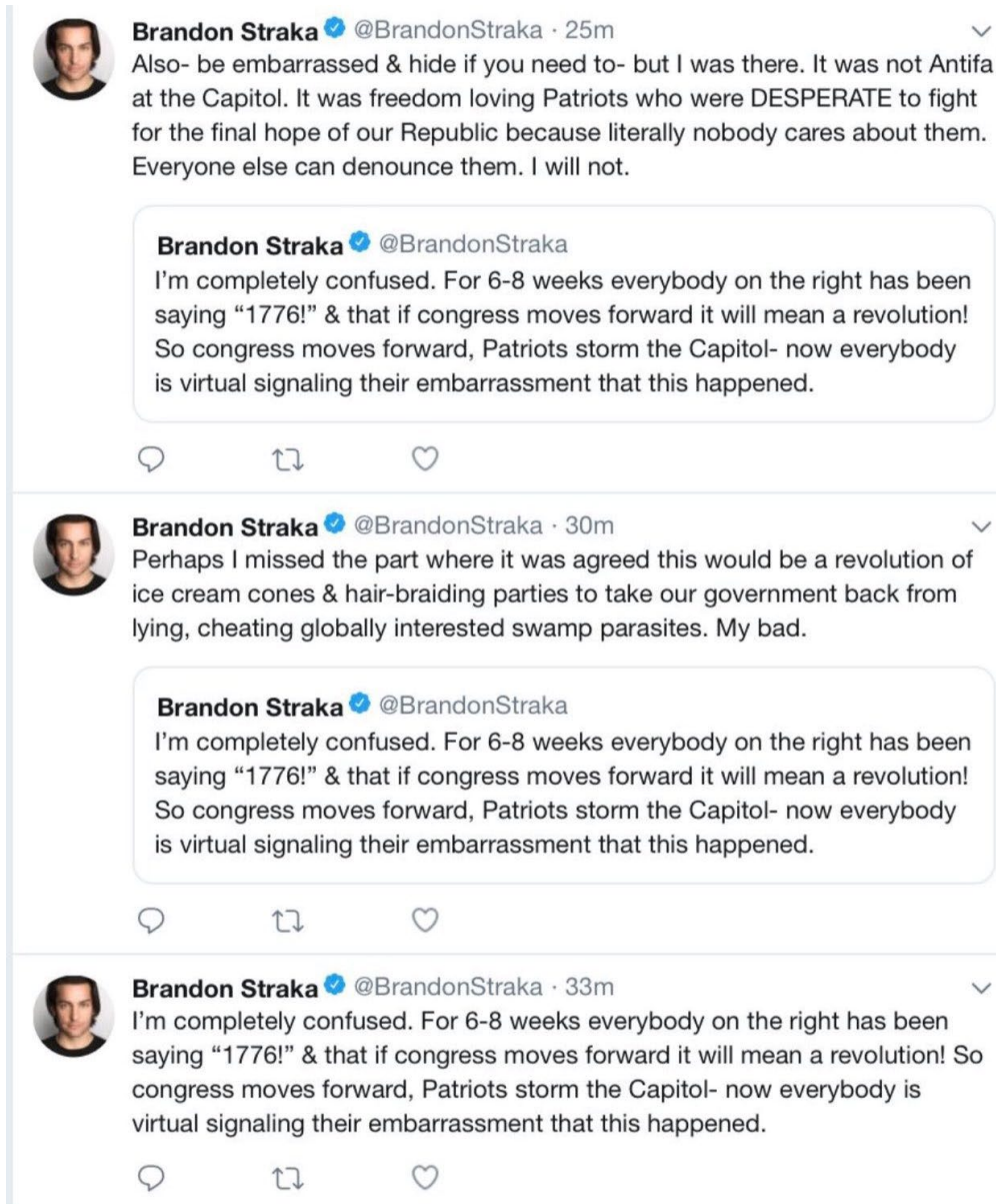
Gov. Figure F