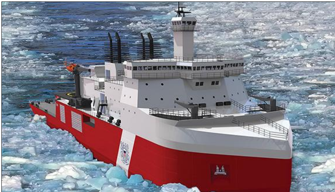
Figure 4. Rendering of Halter Marine Design for PSC