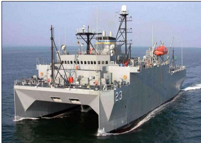
Figure 1. USNS Impeccable (TAGOS-23)