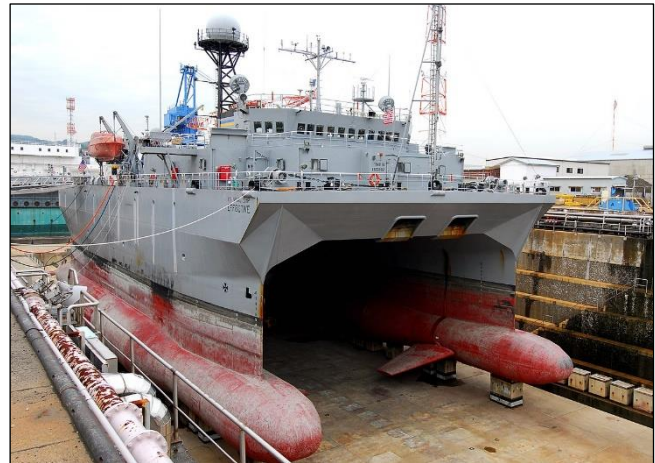
Figure 2. USNS Effective (TAGOS-21) in Dry Dock