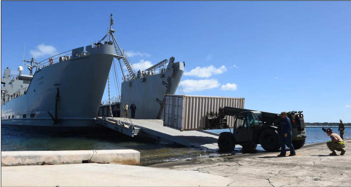
Figure 4. Besson-Class Logistics Support Vessel (LSV)