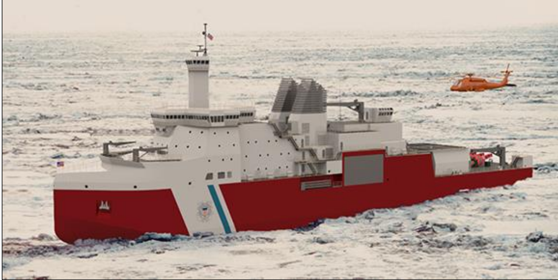
Figure 3. Rendering of VT Halter Design for PSC

A similar image was included in VT Halter press release, “VT Halter Marine Awarded the USCG Polar Security Cutter,” May 7, 2019, accessed May 8, 2019, at http://www.vthm.com/public/files/20190507.pdf .