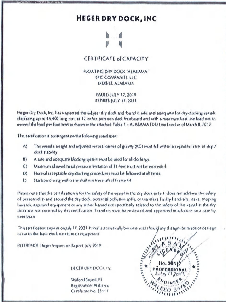
Exhibit 2-1, Drydock Alabama Certificate