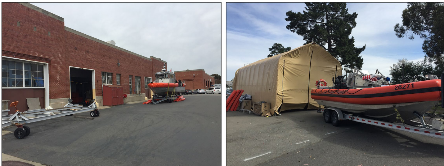
Figure 1: Coast Guard Maintenance Facilities Requiring Refurbishment because They Cannot Accommodate Newer, Taller Boats