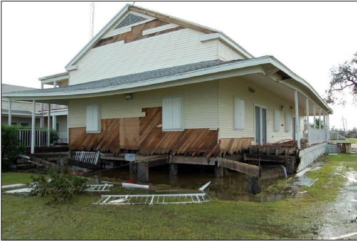
Station Sabine Pass, Hurricane Ike, category II damage to station.