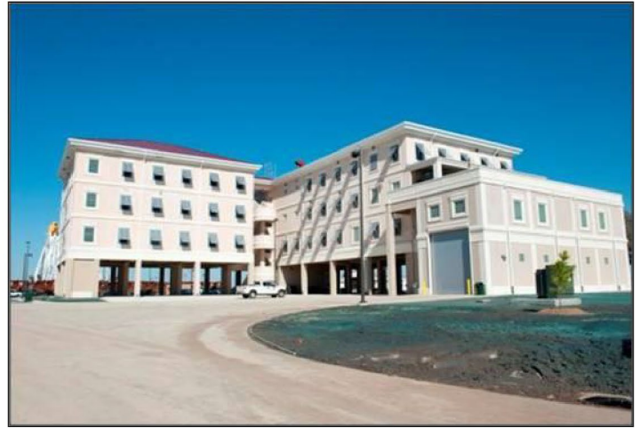
Station Sabine Pass rebuilt to withstand 100 year flood, category III hurricane wind speeds.

Source: U.S. Coast Guard. | GAO-22-105513