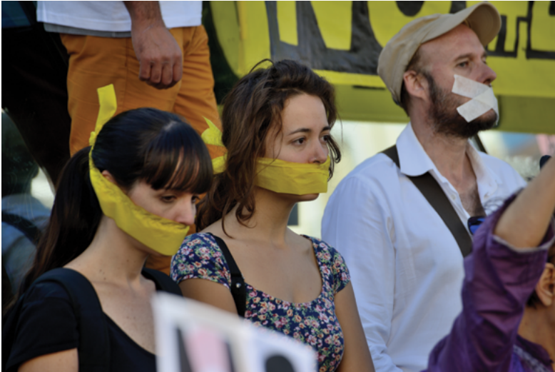
Madrid, Spain—November 1st, 2014, Gag laws.

Enough! For a new legislation that guarantees human rights', issued by Amnesty International Spain and backed by over 260 organizations (Amnesty International 2020). As noted by the Commission's 2021 report (2021: 18), in response to civil society pressure, the Constitutional court reviewed some of the contested articles of Organic Law 4/2015 in 2020 (such as the sanction provided by Article 36.23 of the Law which prohibited "the unauthorized use of images or data of authorities or members of the Security Forces of the State" (BOE 2020) which was in breach of article 20.2 of the Spanish Constitution (freedom of expression and information). However, according to the latest available annual statistics (Anuario Estadístico 2019), the articles most used to sanction citizens under this Law were not among those reviewed by the Constitutional court. 35