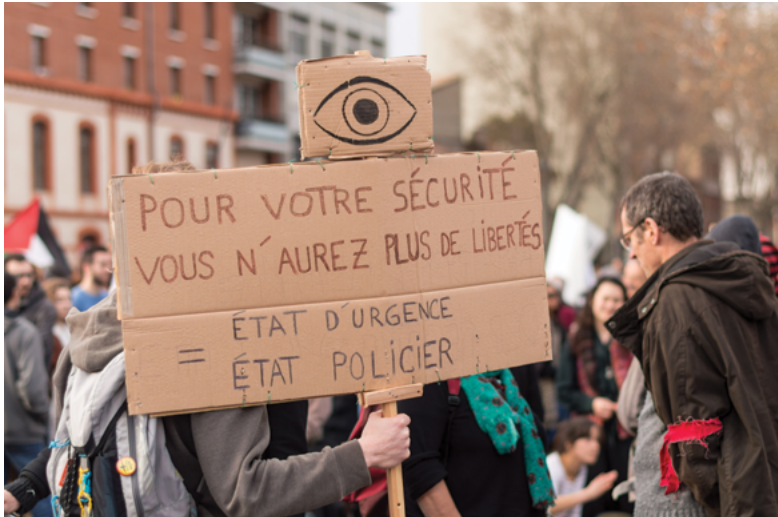
Etat d'urgence. Gyrostat (Wikimedia, CC-BY-SA 4.0)