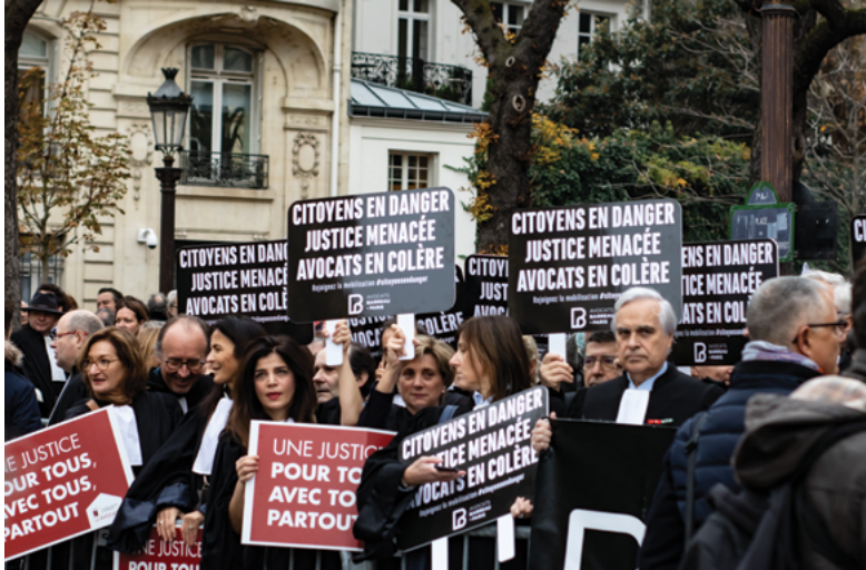
Paris, France—11.15.2018, Protest against the Loi de Programmation.