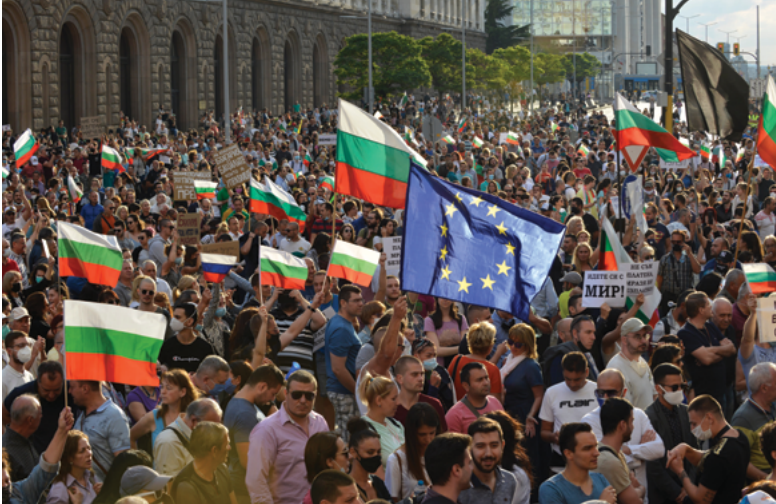
Sofia, Bulgaria—Jul 14 2020, People protesting on the main streets in the capital and demanding PM's resignation.

This misconception was reinforced by Justice Commissioner Reynders during the debates held at the European Parliament on 5 October 2020 , when he stated: “The necessary structures are essentially in place, but Bulgaria has to make them deliver results more efficiently” (EP 2020b). This is a dangerously wrong diagnosis: as stakeholders and scholars have persistently explained, including in direct communication to Commissioner Reynders, the structures themselves are part of the problem. 51 These specialised bodies stand outside the ordinary legal framework, circumventing due process, and are being deployed by the powerful of the day to consolidate their power and deepen the symbiosis between mafia and state. This enables the arbitrary use of power and is hence a direct assault on the rule of law, whose raison d’être is the prevention of tyranny.