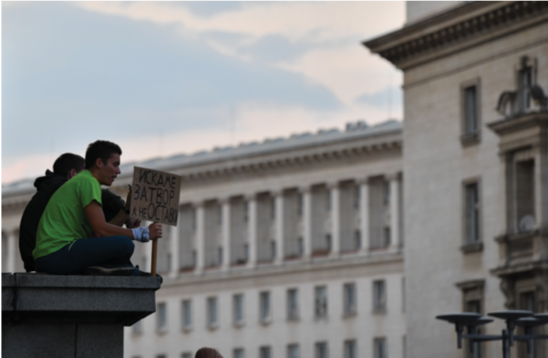
Sofia, Bulgaria—Sept 22 2021 Sofia central area.

Below, we survey some of the omissions and misrepresentations in the Reports' chapters on Bulgaria. Much of the content from the input submitted by anonymous and public stakeholders in the course of the consultation for the first 2020 Report has been ignored by the Commission—we have chosen to stay very close to these primary contributions, due to their value as material which the Commission has decided to leave out upon considered judgment. The European Parliament adopted a Resolution on the Rule of law and Fundamental Rights in Bulgaria on 8 October 2020, several days after the Commission's first Report was published, in which it condemned the systemic violations of the rule of law in the country. We also reference this report in relation to various issues throughout this chapter (EP 2020a).