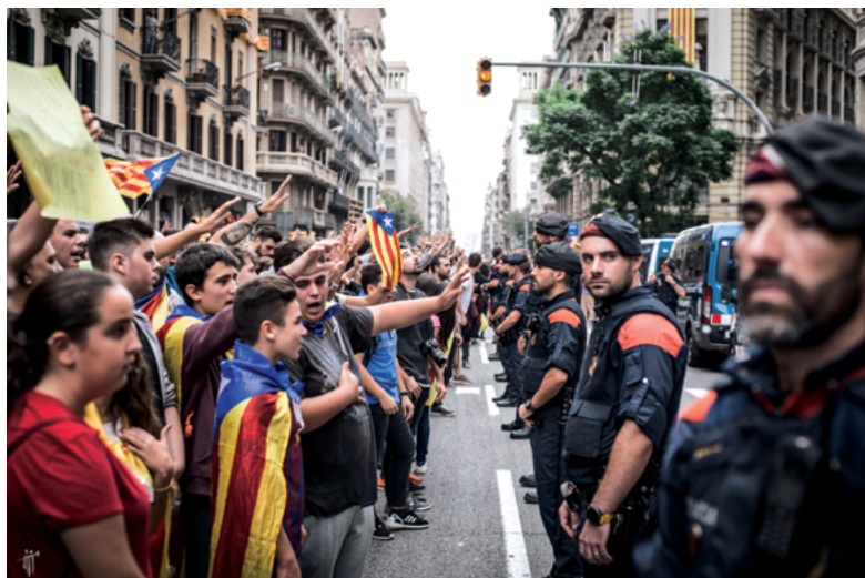
Barcelona, Spain—October 3rd, 2017, Aftermath of the Catalan independence referendum