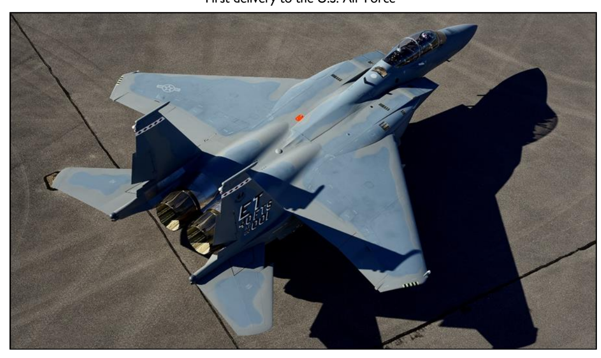
Figure 1. F-15EX Eagle II First delivery to the U.S. Air Force

The Air Force received its first F-15 Eagle air superiority fighter in 1974. Subsequently, the F-15 evolved to encompass more roles, most notably with the deployment of the F-15E Strike Eagle in 1989. The F-15E added substantial air-to-ground capability, including a second cockpit for a weapons systems officer. The Air Force has 453 F-15s of all variants, the newest of which, an F-15E, was ordered in 2001. Following the last U.S. order, F-15s have continued in production for a variety of international customers, including (among others) Israel, Saudi Arabia, and Japan.