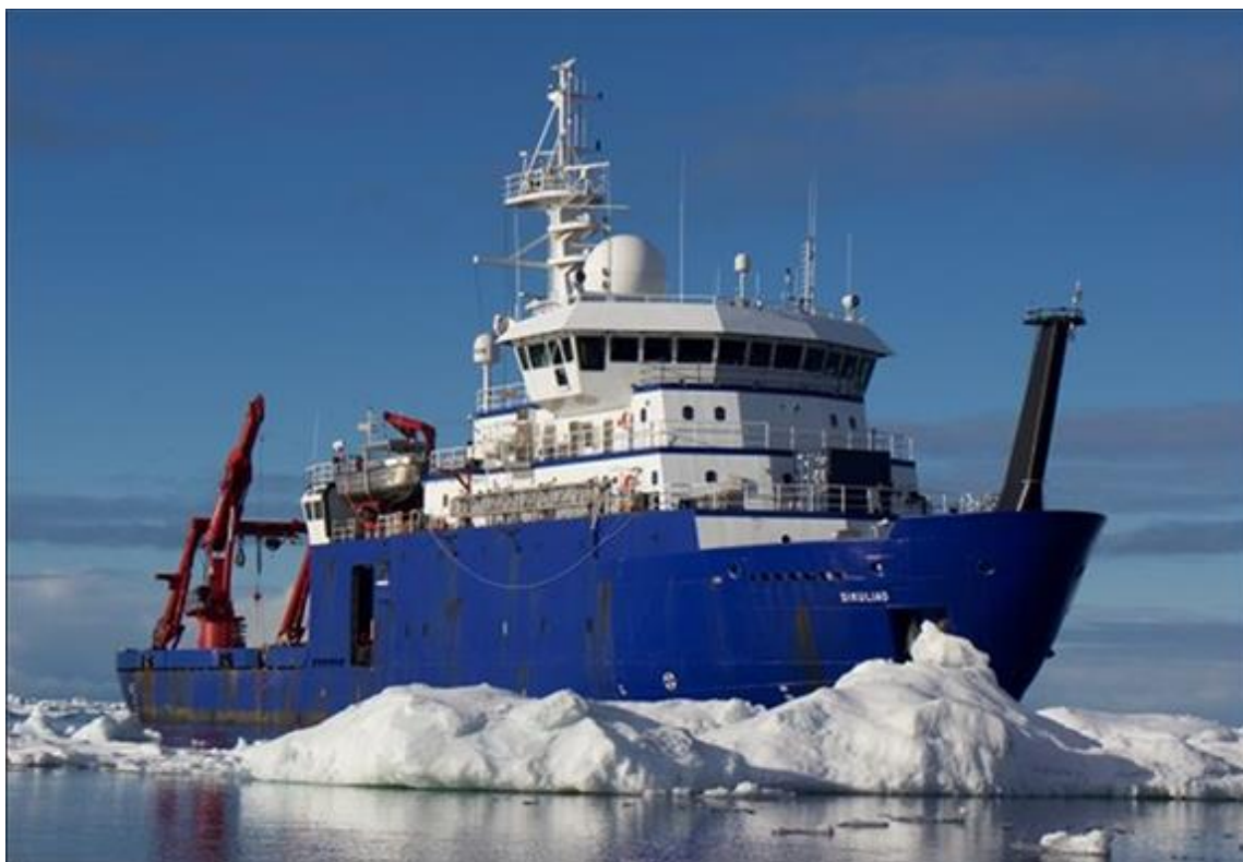
Figure A-6. Sikuliaq