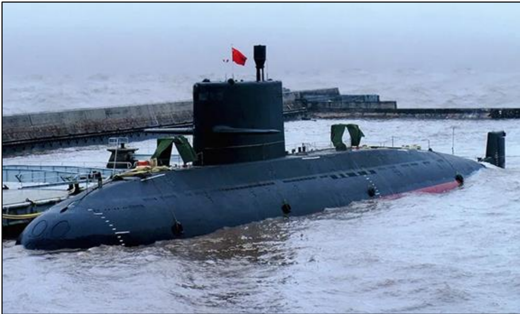
Figure 6. Yuan (Type 039) Attack Submarine (SS)