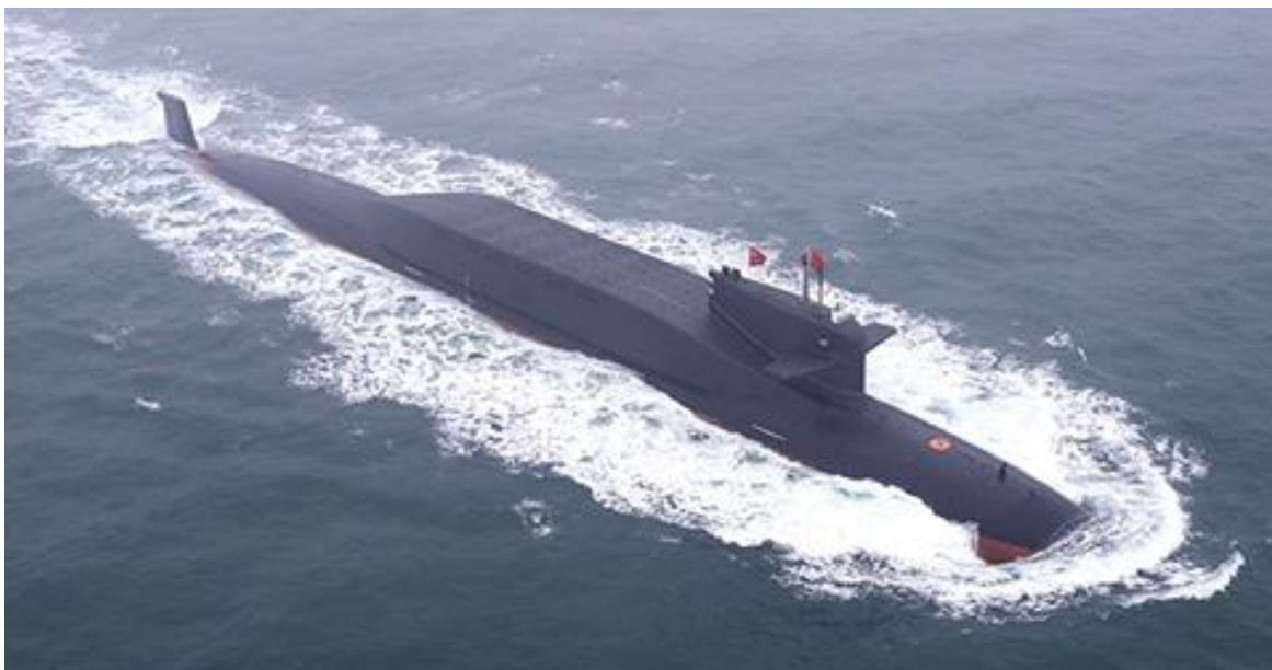
Figure 8. Jin (Type 094) Ballistic Missile Submarine (SSBN)