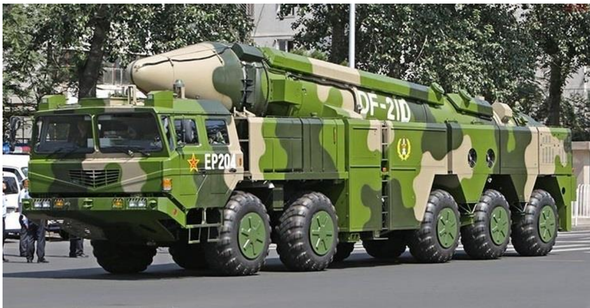
Figure 1. DF-21D Anti-Ship Ballistic Missile (ASBM)