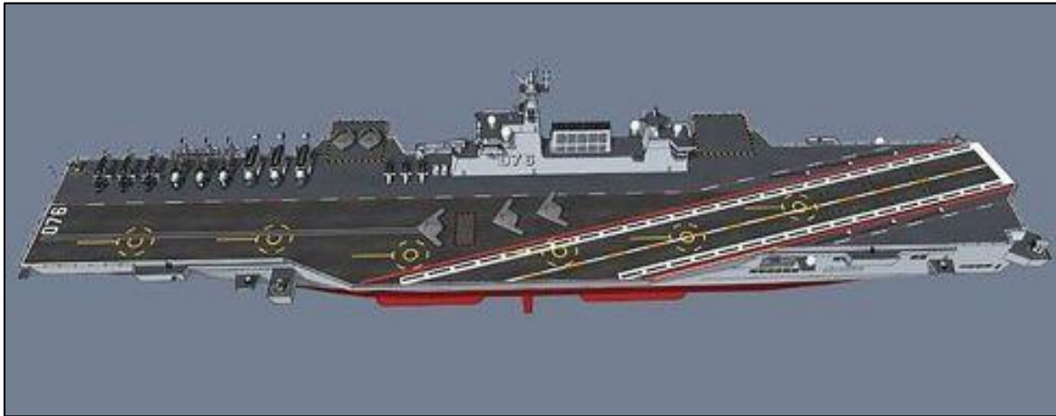
Figure 22. Notional Rendering of Possible Type 076 Amphibious Assault Ship

Source: Illustration accompanying Minnie Chan, "Chinese Shipbuilder Planning Advanced Amphibious Assault Ship," South China Morning Post , July 27 (updated July 28), 2020.