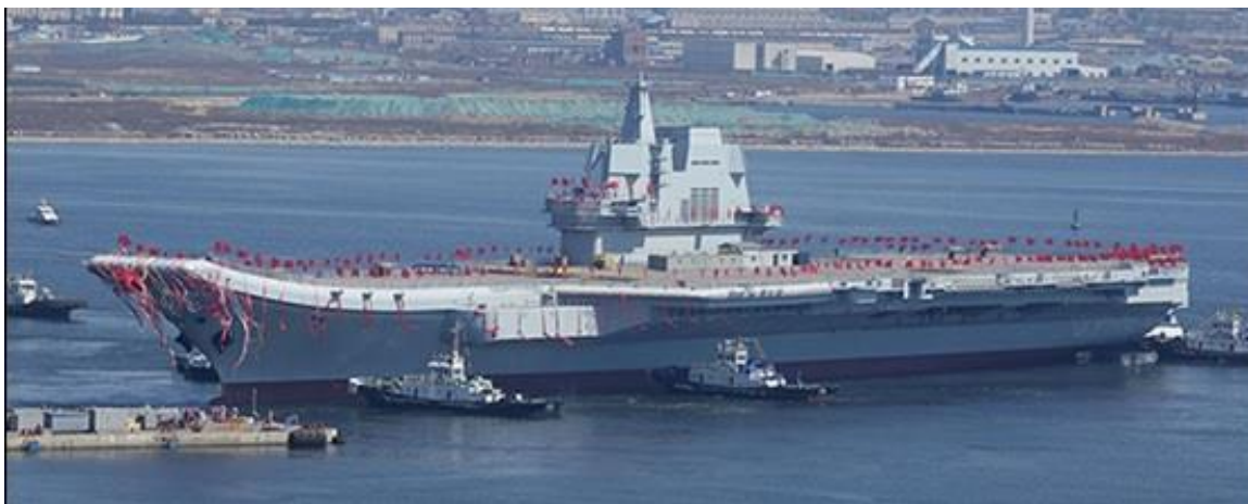
Figure 10. Shandong (Type 002) Aircraft Carrier