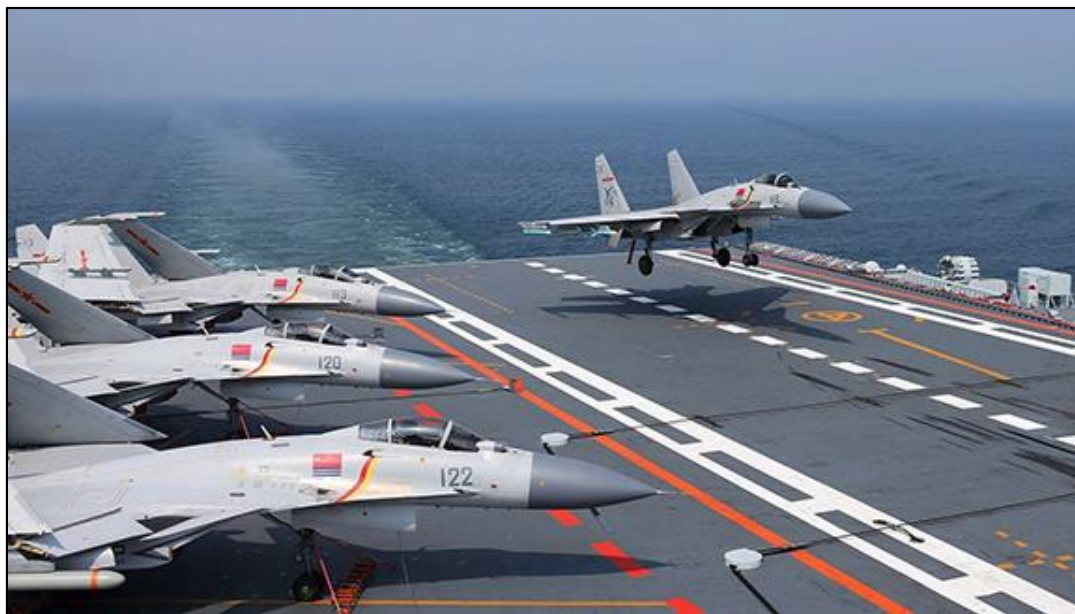
Figure 12. J-15 Flying Shark Carrier-Capable Fighter