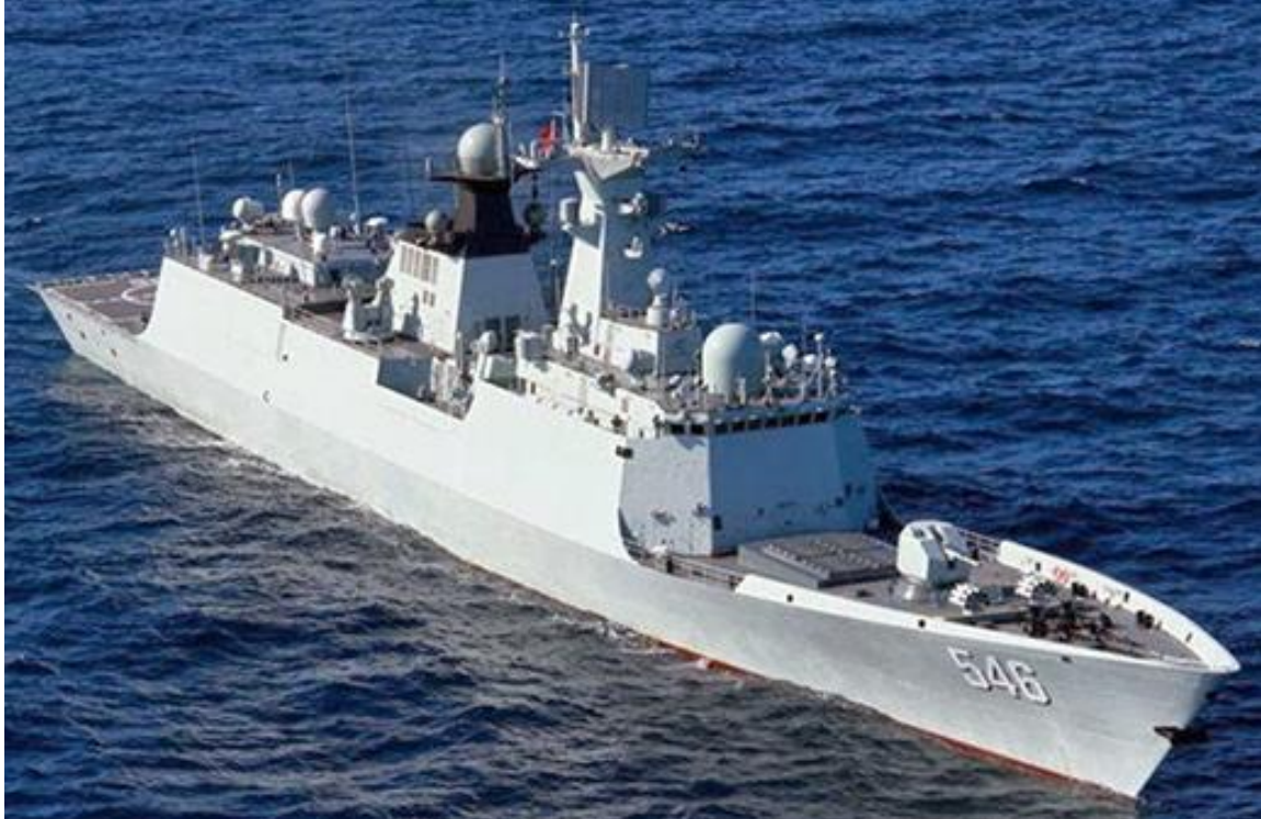
Figure 16. Jiangkai II (Type 054A) Frigate