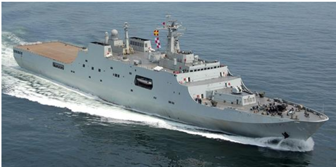
Figure 18. Yuzhao (Type 071) Amphibious Ship