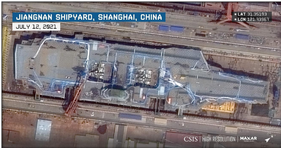
Figure 11. Type 003 Aircraft Carrier Under Construction