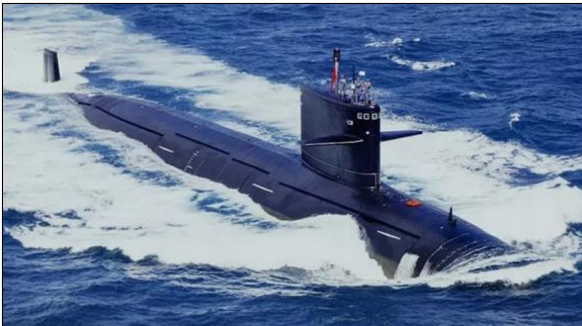
Figure 7. Shang (Type 093) Attack Submarine (SSN)