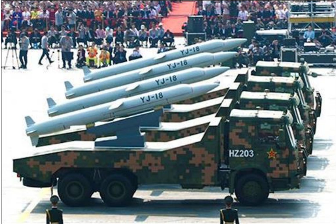
Figure 4. Reported Image of Anti-Ship Cruise Missile (ASCM)

Source: Photograph accompanying “YJ-18 Eagle Strike CH-SS-NX-13,” GlobalSecurity.org, updated October 1, 2019. The article states “A grand military parade was held in Beijing on 01 October 2019 to mark the People’s Republic of China’s 70 th founding anniversary.... One weapon featured was a new generation of anti-ship missiles called YJ-18. China unveiled YJ-18/18A anti-ship cruise missiles in the National Day military parade in central Beijing.”)