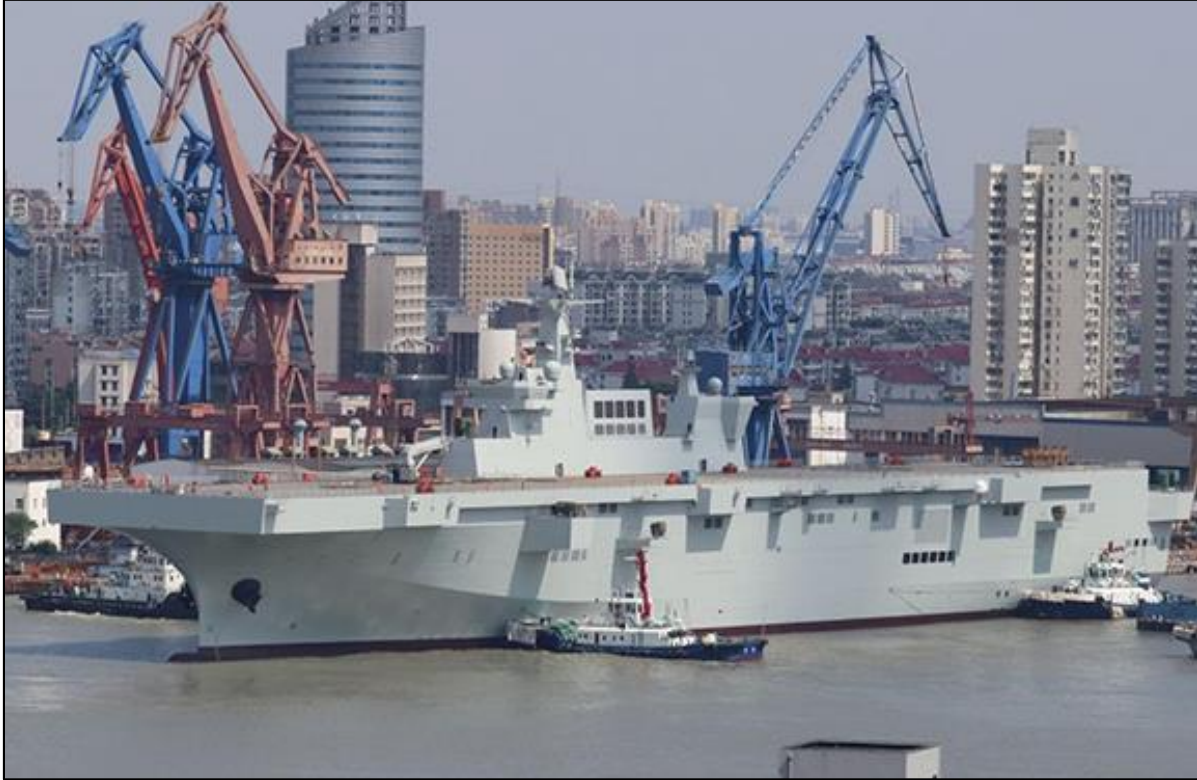
Figure 19. Type 075 Amphibious Assault Ship