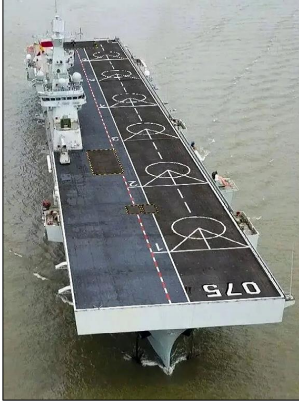
Figure 20. Type 075 Amphibious Assault Ship

Possible Type 076 Catapult-Equipped Amphibious Assault Ship