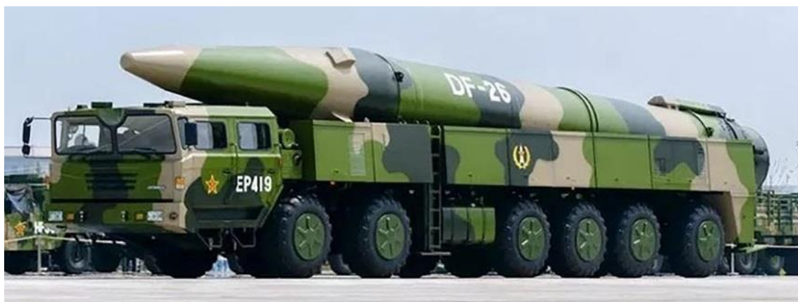
Figure 2. DF-26 Multi-Role Intermediate-Range Ballistic Missile (IRBM)