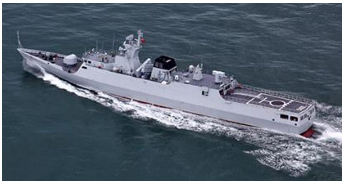
Figure 17. Jingdao (Type 056) Corvette