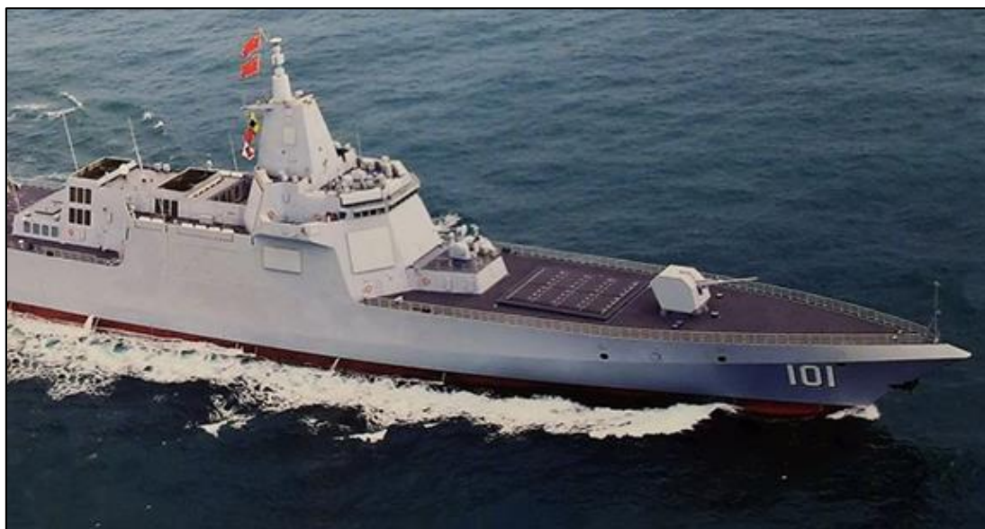
Figure 14. Renhai (Type 055) Cruiser (or Large Destroyer)