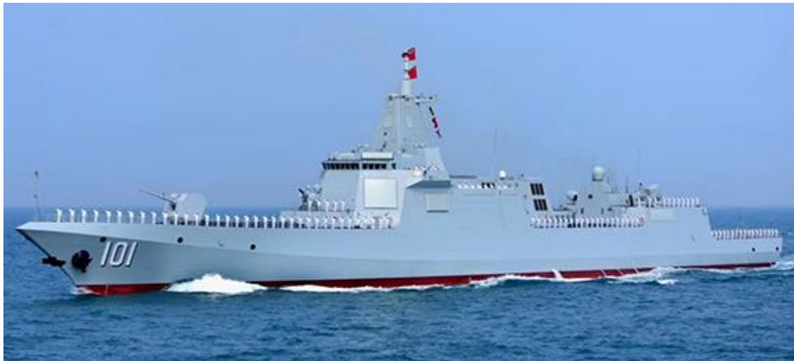
Figure 13. Renhai (Type 055) Cruiser (or Large Destroyer)