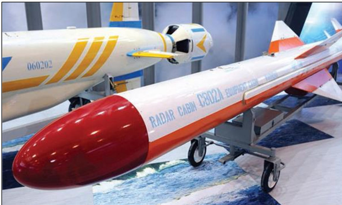
Figure 5. Reported Image of Anti-Ship Cruise Missile (ASCM)