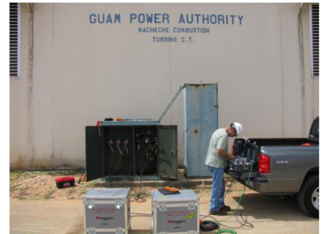
Guam Power Authority employee tests equipment for military installations on Guam.

A DOD-funded resilience study (FY 20–22) will result in a comprehensive plan with specific courses of action to cohesively address and mitigate the combined effects of land subsidence, sea level rise, ground water change, coastal flooding/storm surge, and inadequate stormwater management at USNA. Courses of action will include a mix of approaches: structural (seawalls, bulkheads, floodwalls, stormwater retrofits), natural (earthen berms/levees, rain gardens, living shorelines), non-structural (changes in land use), and temporary solutions to issues where long-term permanent protection may take years to implement. The installation is in the midst of implementing additional stormwater repair projects and proposing to repair and restore the seawall and shoreline along the installation to address structural deficiencies on the existing seawall and potential impacts from future extreme weather events, storm surge, sea level rise, and land subsidence.