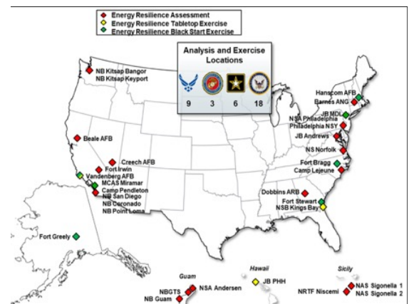
Figure 2. Site-level map of energy resilience assessment locations

Marine Corps Recruit Depot (MCRD) Parris Island: MCRD Parris Island completed a Climate Change Adaptation and Resilience (CCAR) assessment that resulted in changes to its master plan projects and adaptation strategies from spatial planning; to redirecting development away from high-risk areas; to infrastructure projects to manage and respond to sea level rise and effects of climate change. Adaptation projects include stormwater system upgrades, battalion training facilities elevation (main campus), road network upgrades, tidal exclusion barrier, page field training facilities relocations, and reforestation.