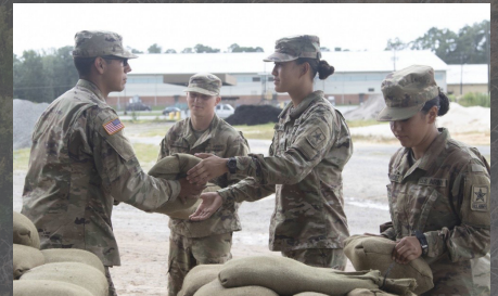
On September 5, 2019, trainees at Fort Jackson, S.C., stack sandbags for use throughout the hurricane season. The Army recently introduced a new directive to prepare the service's installations against the growing threat of climate change.