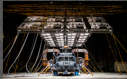
An HH-60W Jolly Green II sits under bright lights used to create heat in the McKinley Climatic Lab March 19 at Eglin Air Force Base, Florida. The Air Force's new combat search and rescue helicopter and crews experienced temperature extremes from 120 to minus 60 degrees Fahrenheit as well as torrential rain during the month of testing. The tests evaluate how the aircraft and its instrumentation, electronics and crew fare under the extreme conditions it will face in the operational Air Force.