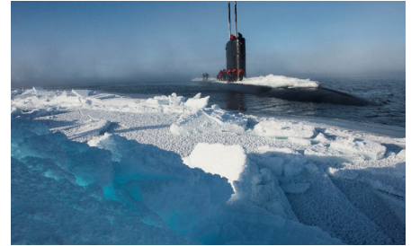
The submarine USS Hartford surfaces near Ice Camp Sargo during Ice Exercise 2016 in the Arctic Circle, March 19, 2016.

Climate considerations must continue progress toward becoming an integral element of DOD’s enterprise-wide resource allocation and operational decision-making processes. Climate assessments must be based on the best available, validated, and actionable climate science that informs the most likely climate change outcomes. Climate data sources must be continuously monitored and updated—with consideration of the operational impact—to account for the rapid rate of climate change and its impacts. All other actions in this plan are dependent on the outcomes of this effort.