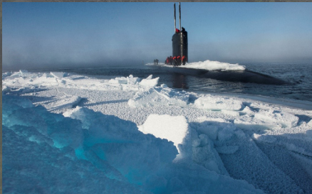
The submarine USS Hartford surfaces near Ice Camp Sargo during Ice Exercise 2016 in the Arctic Circle, March 19, 2016.