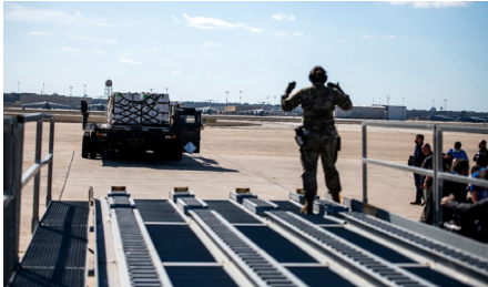
Air Force Airman loads pallets of water into a C-17 Globemaster at Joint Base San Antonio-Kelly Field, Texas.

A climate-resilient supply chain is one in which the Department has ensured that key suppliers and industries can still operate though impacted by climate change. DOD must also consider logistic support of supply chains (e.g., fuel, power requirements) especially in austere locations that are more vulnerable to the effects of climate change. To remain agile and flexible in responding to changing conditions, actions will include energy demand reduction to reduce logistics requirements and establish metrics and measures for tracking progress. The DOD acquisition system must consider operational energy as stated in the Operational Energy KPP (10 USC 2911) that reduces the logistical footprints of contingency locations. Other optimization of logistical support requirements (e.g., water) can improve resilience and make supply lines less vulnerable to the effects of climate change and adversaries.