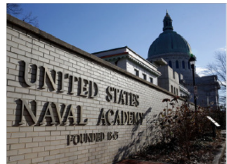
An entrance to the U.S. Naval Academy campus in Annapolis, Maryland (January 9, 2014).