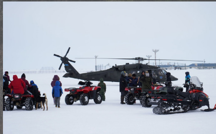
Representatives from the Alaska Department of Military and Veterans Affairs, the Department of Environmental Conservation, and the Department of Commerce, Community and Economic Development load onto an Alaska Army National Guard UH-60 Black Hawk helicopter in Chevak, Alaska, on April 9, 2021 to meet with tribal leaders and citizens in Bethel, Tuluksak, and Chevak to discuss disaster assistance measures and preparation for the upcoming flood season.