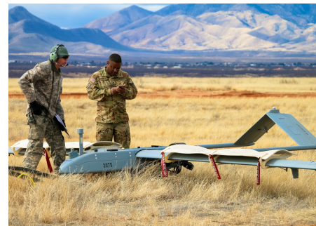
Soldiers conduct unmanned aerial system training for readiness-level progression at Fort Huachuca.