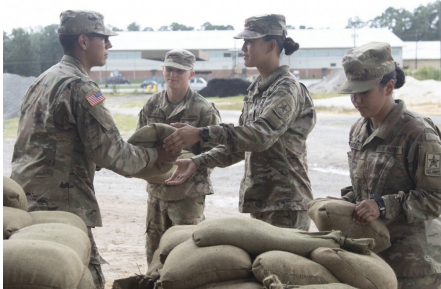
On September 5, 2019, trainees at Fort Jackson, S.C., stack sandbags for use throughout the hurricane season.

Built and natural infrastructure are both necessary for successful mission preparedness and readiness. Built infrastructure serves as the staging platform for the Department’s national defense and humanitarian missions; natural infrastructure supports military combat readiness by providing realistic operational testing and combat environments and conditions. Installations and their built and natural infrastructure also serve as the platforms from which the DOD cares for its people and projects and sustains forces. Many global operational missions are accomplished and/or sustained from DOD installations. Changing climate provides an opportunity to reevaluate use of regional approaches that allow for flexibility to adjust to changing conditions while providing an appropriate level of standardization for resilience, efficiency, and costs.