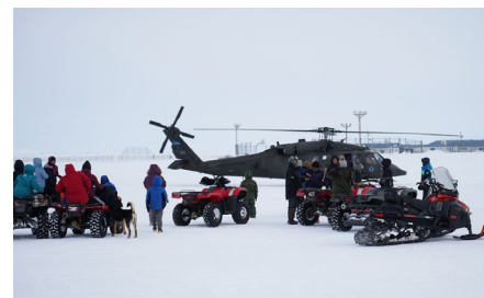
Community members of the city of Chevak, Alaska, meet with tribal leaders and citizens to discuss disaster assistance measures and processes in light of recent emergencies in preparation for the upcoming flood season.

Instituting effective and efficient climate adaptation over the range of DOD missions, operations, and infrastructure requires leveraging all relevant information, methods, technologies, and approaches. This can only be achieved through close collaboration with others. The Department will build unity of effort and mission across DOD components, commands, services, and theaters to exploit lessons learned and economies of scale. Close cooperation with all who have a stake in our national security (other federal agencies, Congress, private industry, academia, NGOs, the American people, and allies), as well as other nations, will help secure our common interests and promote our shared values.