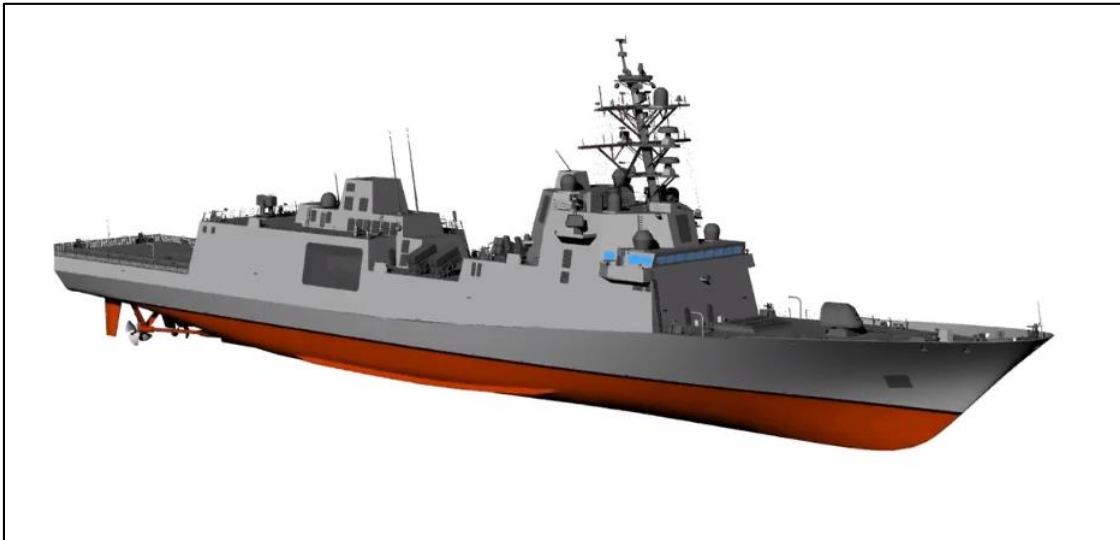
Figure 3. Constellation (FFG-62) Class Frigate Computer rendering of F/MM design