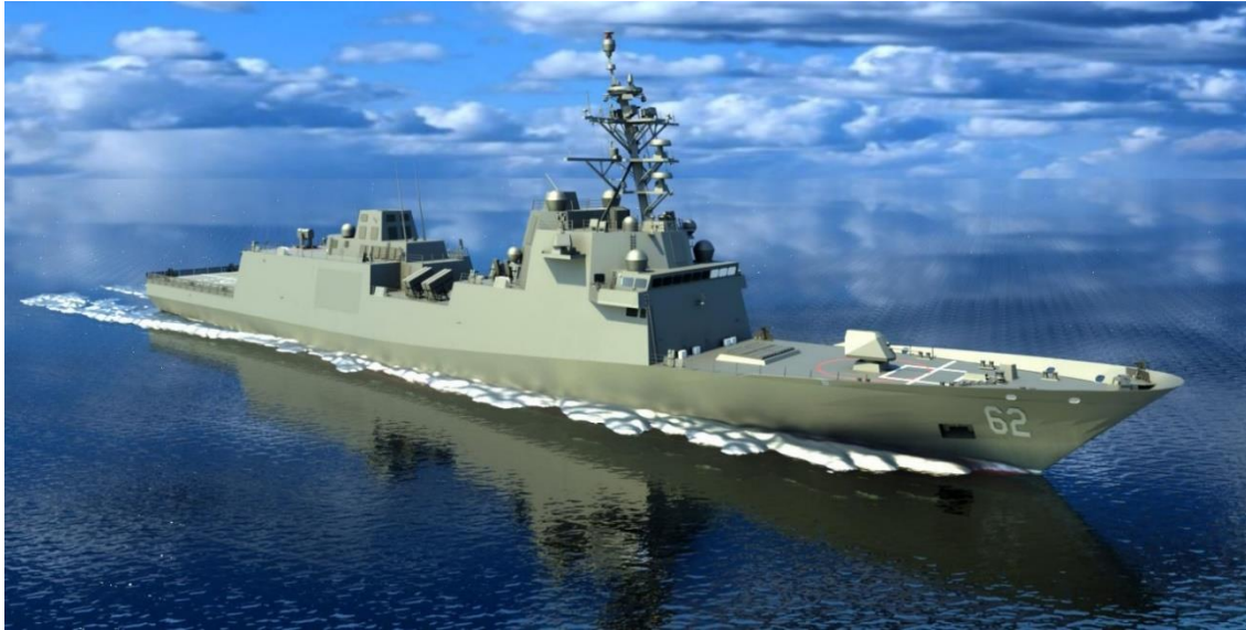
Figure 2. Constellation (FFG-62) Class Frigate Artist’s rendering of F/MM design