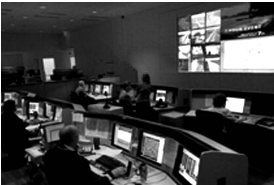
Kentucky's Fusion Center.