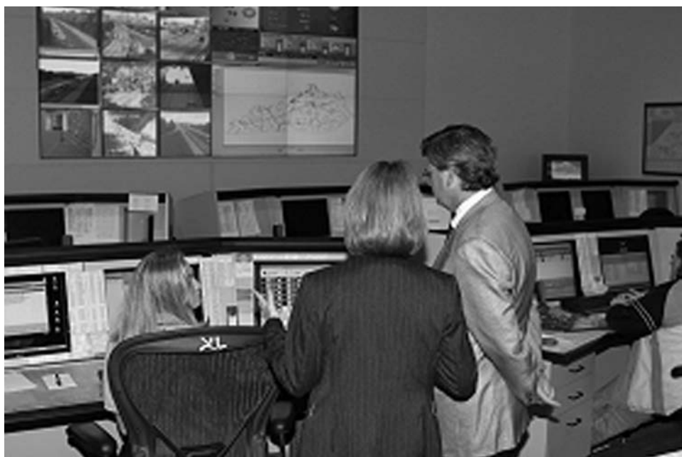
Kentucky Governor Ernie Fletcher tours Kentucky's fusion center.

It is clear that not all fusion centers are engaging in improper or worrisome activities, and not all fusion center functions raise civil liberties or privacy concerns. But the statements and activities of some, combined with the push to standardize and weave together these state institutions, do raise questions about the overall direction in which they are headed. In particular, the federal government's vision as outlined in its Guidelines raises many concerns, as does the continuing lack of a legal framework to regulate the centers' activities.