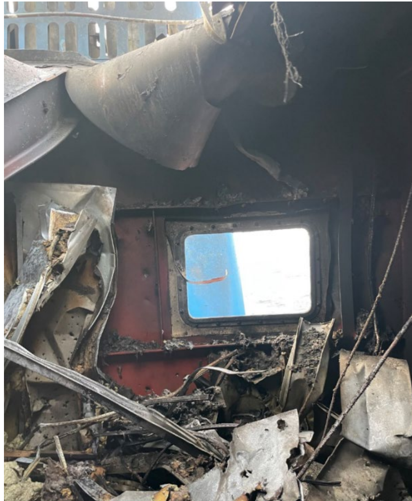
(U) Internal View of Impact Site from Iranian UAV Attack