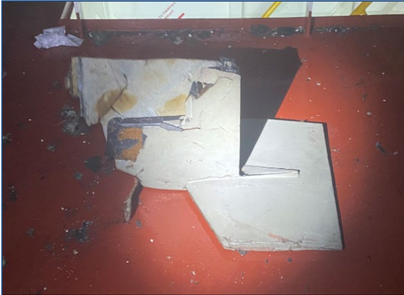
(U) Vertical Stabilizer Identical to Iranian UAV