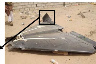
(U) Vertical Stabilizer on Iranian UAV

FORENSIC CONCLUSIONS: 1) Verified components of the Iranian one-way attack UAV were identical to previously identified Iranian unmanned one-way attack systems, and 2) Confirmed the Iranian UAV was explosive laden.