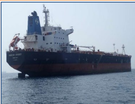
(U) M/V MERCER STREET