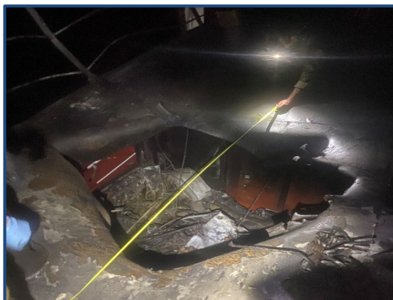
(U) EOD Site Assessment of Iranian Attack