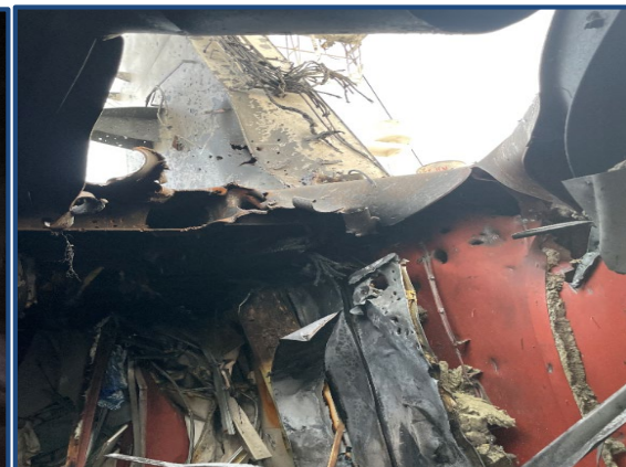
(U) Internal View of Iranian UAV Impact Site