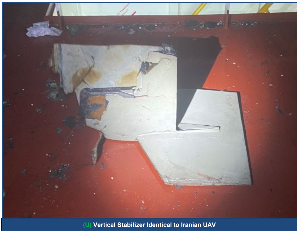
(U) Vertical Stabilizer Identical to Iranian UAV