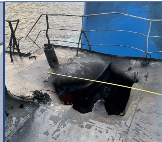
(U) Iranian UAV Impact Location