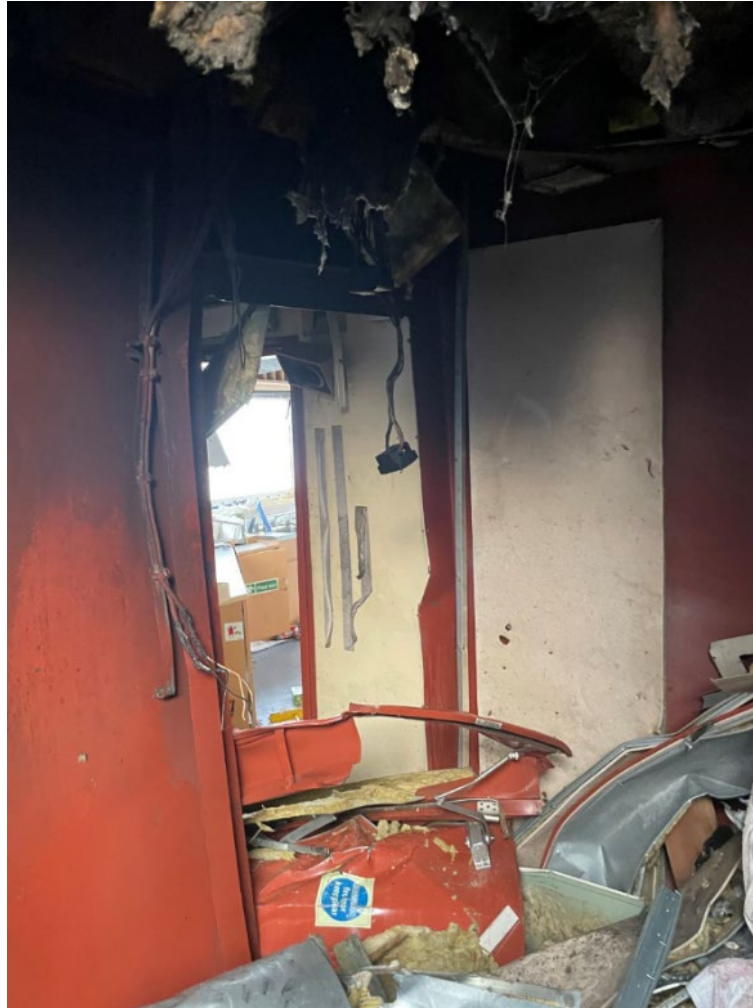
(U) Internal View of Impact Site from Iranian UAV Attack