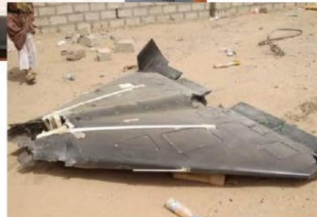
Sep 2020: Larger Iranian Delta Wing UAV Crash in Yemen

Iran has publically displayed delta wing, one-way attack UAVs consistent with UAVs observed operating across the Middle East in recent years.