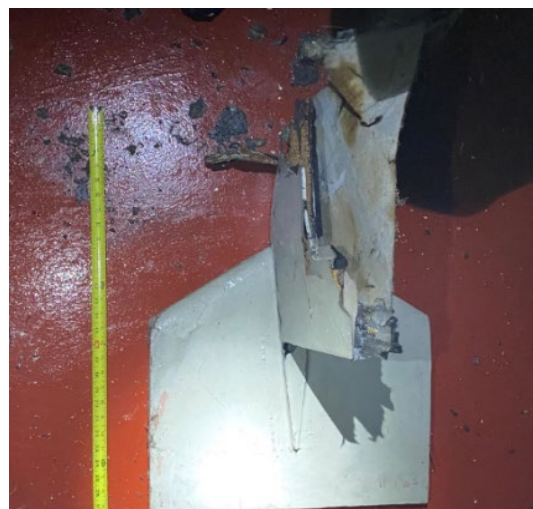
(U) Side and Top View of Iranian UAV Fin