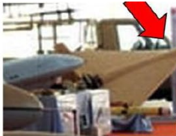
May 2014: Smaller Delta Wing UAV on Display in Iranian Airshow