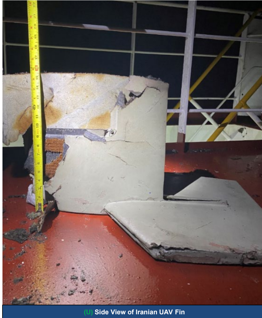
(U) Side View of Iranian UAV Fin