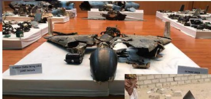
May 2019: Iranian Smaller Delta Wing UAV Used in Attack on Saudi Arabia