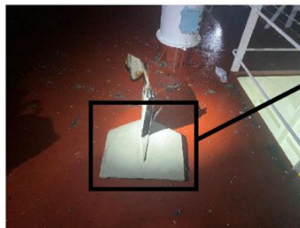
(U) From UAV on MERCER STREET