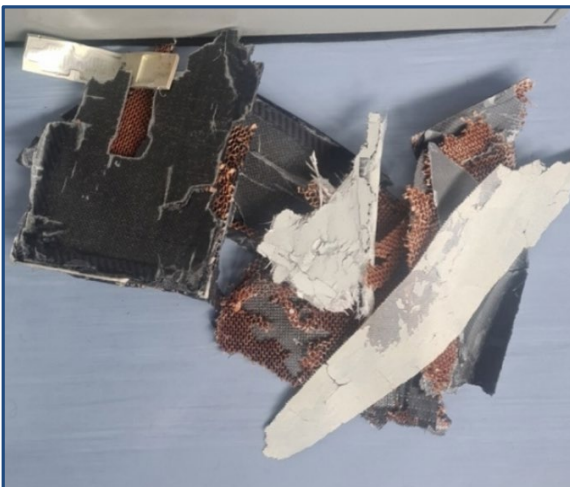
(U) Debris From Failed Iranian UAV Attack