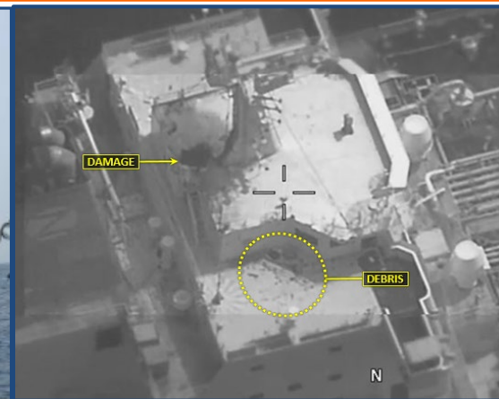
(U) Damage Caused by Iranian UAV Attack