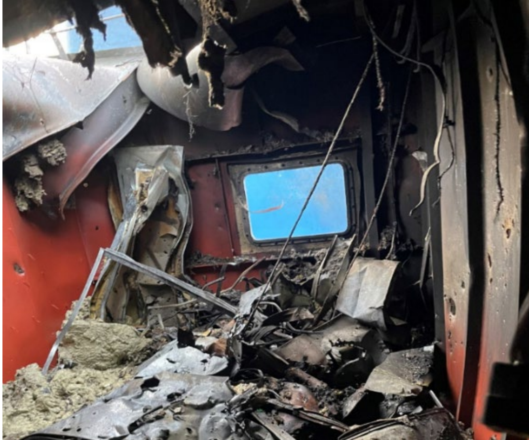
(U) Internal View of Iranian UAV Impact Site