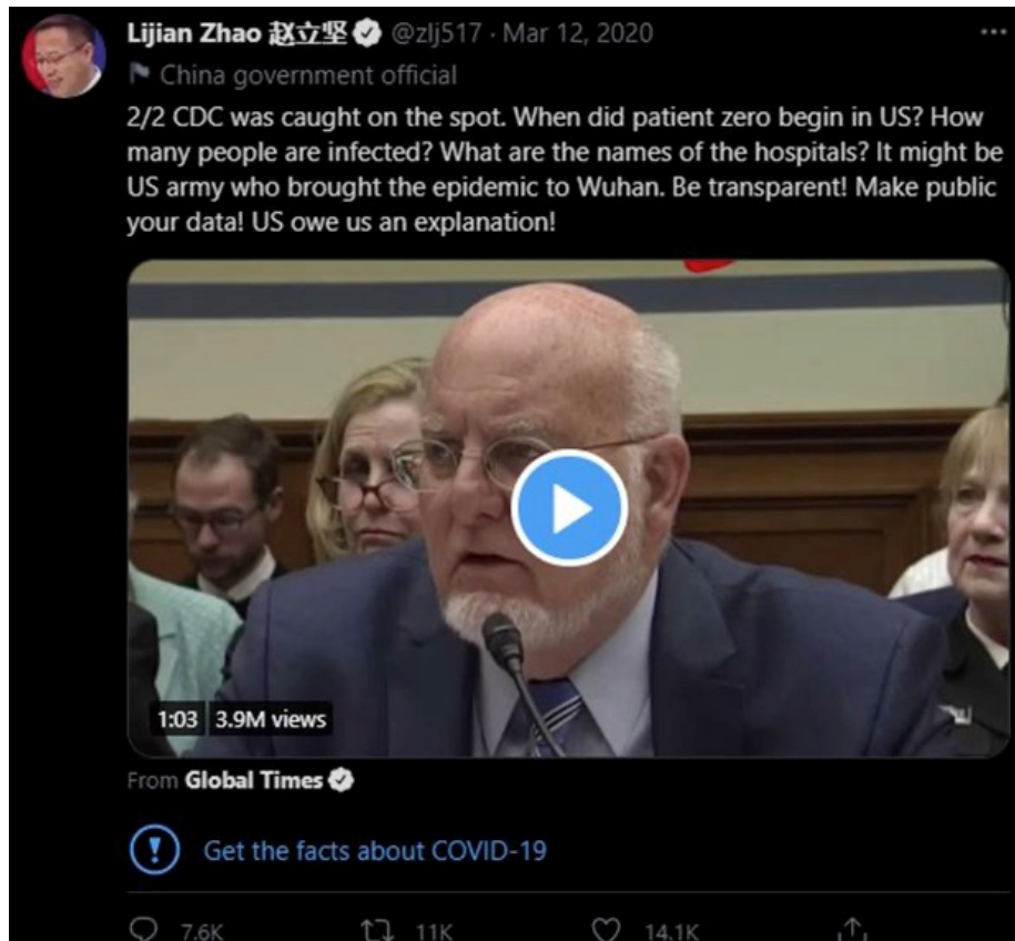
Fig. 12: PRC Spokesman Tweet Suggesting COVID-19 Arrived in Wuhan via the Military World Games