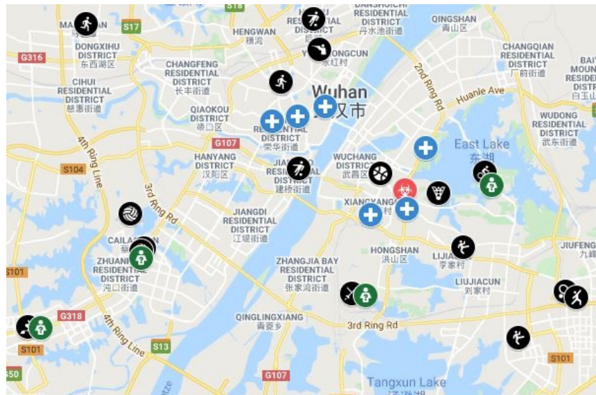
Map 2: WIV Headquarters, Hospitals, MWG Venues, and Sick Athletes

At least four countries who sent delegations to the MWGs have now confirmed the presence of SARS-CoV-2 or COVID-19 cases within their borders in November and December 2019, before the news of an outbreak first became public.