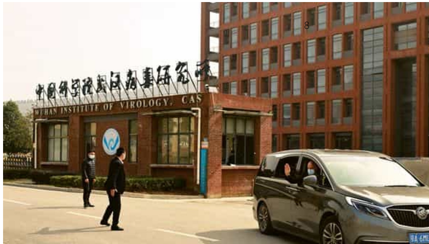
Fig. 1: Wuhan National Biosafety Laboratory (WNBL)

The WIV was founded in 1956 as the Wuhan Microbiology Laboratory and has operated under the administration of the Chinese Academy of Sciences since 1978. 6 The institute currently occupies at least two campuses – the much-discussed Wuhan National Biosafety Laboratory (WNBL) in Zhengdian Scientific Park (see Figure 1), and the older facility (hereafter WIV Headquarters) located in the Xiaohongshan park in the Wuchang District of Wuhan (see Figure 2). The WNBL is a large complex with multiple buildings that house 20 Biosafety Level II (BSL-2) laboratories, two Biosafety Level III (BSL-3) laboratories, and 3000 square meters of Biosafety Level IV (BSL-4) space, “including four independent laboratories areas and two animal suites.” 7 Construction was completed in 2015, but due to delays the BSL-4 space did not become operational until early 2018. 8