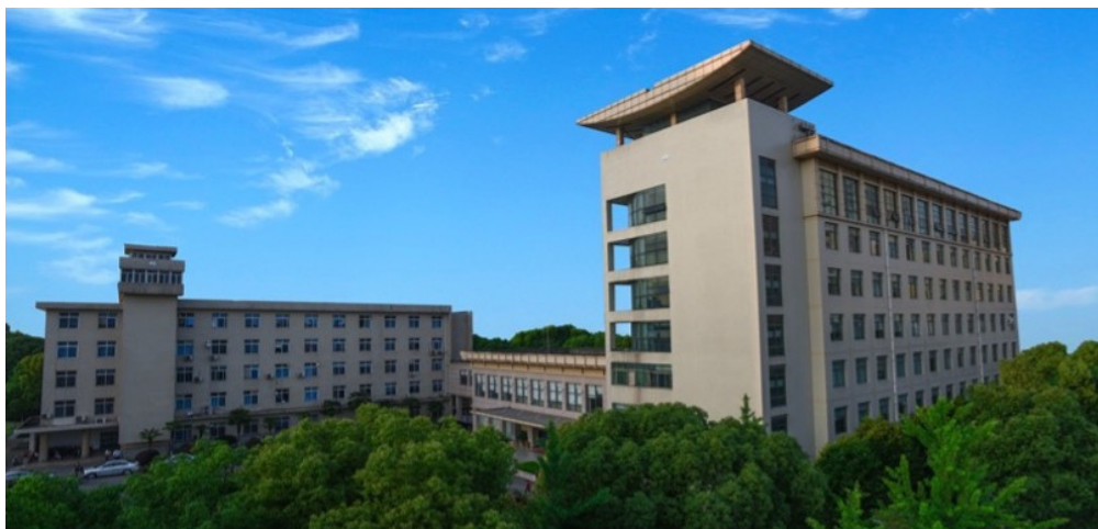
Fig. 2: WIV Headquarters in Wuchang

It was here, in the center of Wuhan, that Dr. Shi Zheng-li and her team conducted gain-of-function research on coronaviruses in the years leading up to the COVID-19 pandemic.