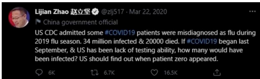
Fig. 13: PRC Spokesman Tweet Suggesting the COVID-19 Pandemic Started in September 2019.

Another tweet by Zhao actually suggests the pandemic did start in September, as is suggested in this addendum, but that it began in the United States. 187