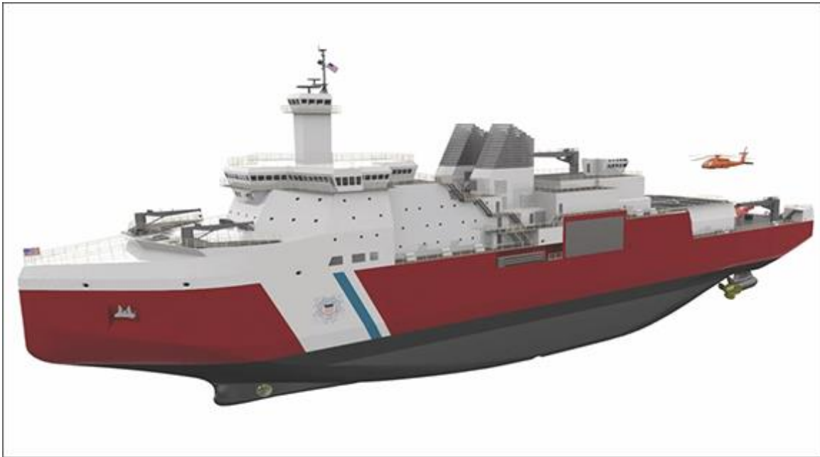
Figure 1. Rendering of VT Halter Design for PSC

Source: Illustration accompanying Sam LaGrone, “UPDATED: VT Halter Marine to Build New Coast Guard Icebreaker,” USNI News, April 23, 2019, updated April 24, 2019. The caption to the illustration states “An artist’s rendering of VT Halter Marine’s winning bid for the U.S. Coast Guard Polar Security Cutter. VT Halter Marine image used with permission.”