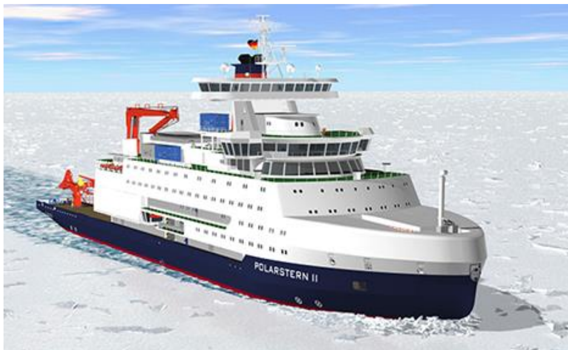
Figure 5. Rendering of SDC Concept Design for Polarstern II