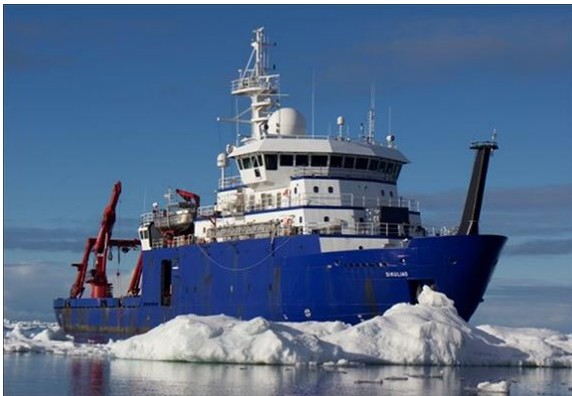
Figure A-6. Sikuliaq