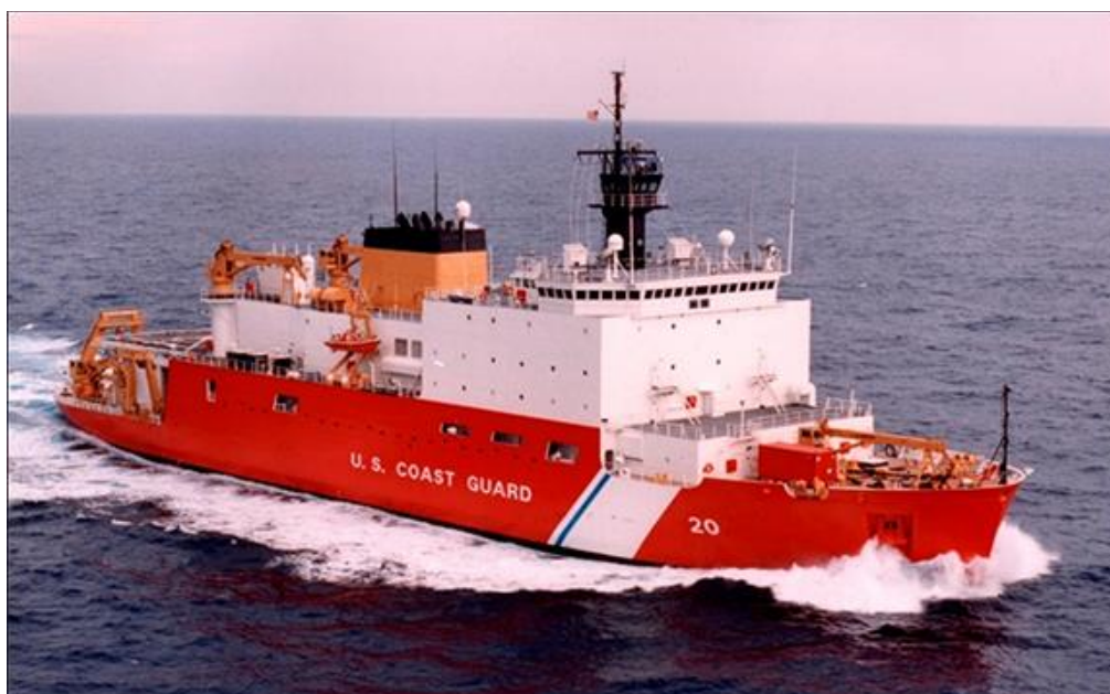
Figure A-3. Healy