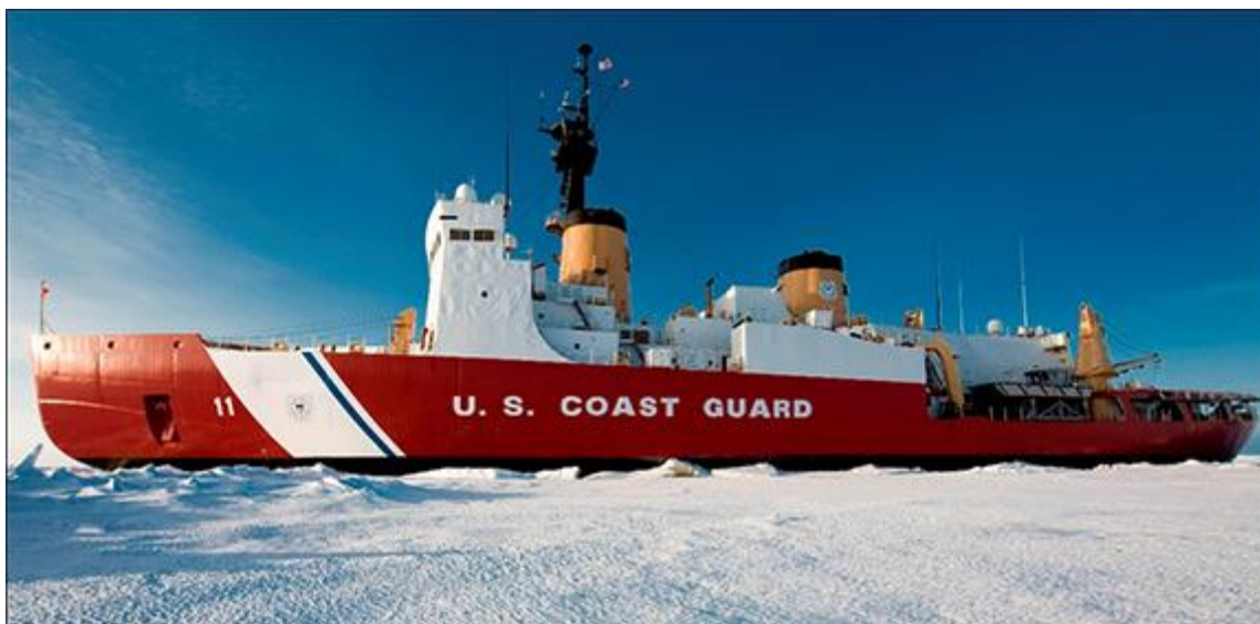
Figure A-2. Polar Sea

Source: Coast Guard photograph that was accessed April 21, 2011, at http://www.uscg.mil/pacarea/cgcpolarsea/img/PSEApics/FullShip2.jpg (link no longer active). The photograph accompanies Associated Press, “Reprieve for Seattle-Based Icebreaker Polar Sea ,” KOMO News, June 15, 2012, posted at https://komonews.com/news/local/reprieve-for-seattle-based-icebreaker-polar-sea .