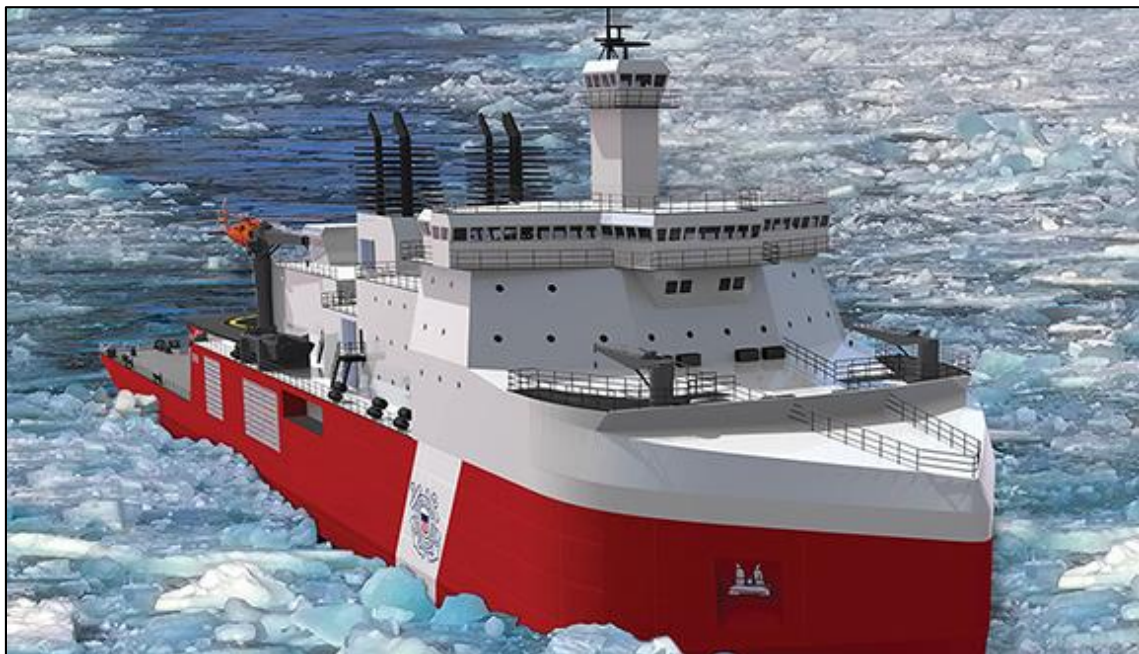
Figure 4. Rendering of VT Halter Design for PSC