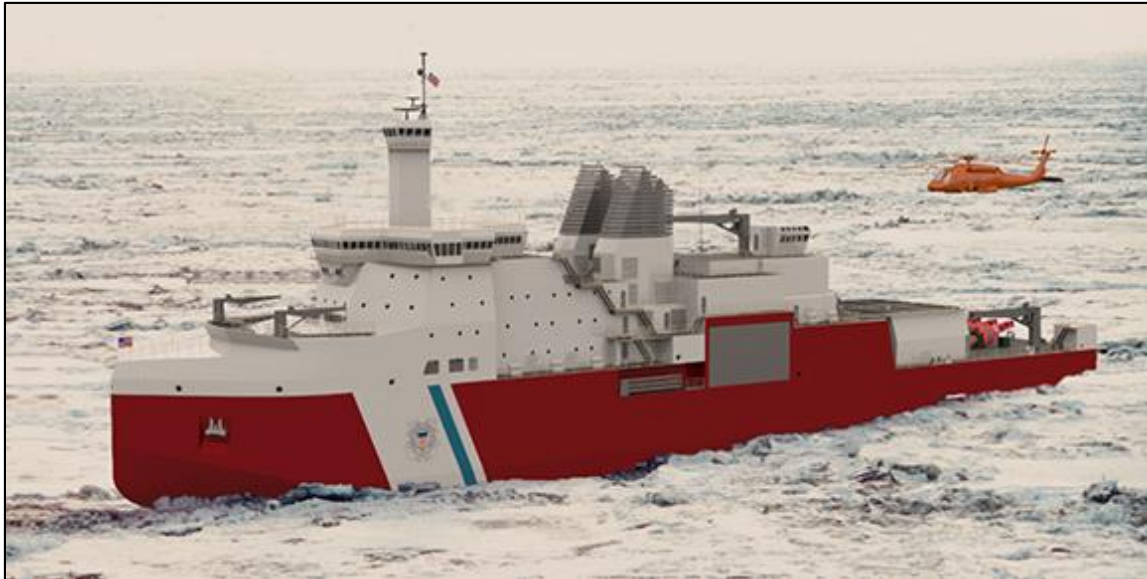
Figure 3. Rendering of VT Halter Design for PSC

Source: Technology Associates, Inc. (cropped version of rendering posted at http://www.navalarchitects.us/pictures.html , accessed June 10, 2020). A similar image was included in VT Halter press release, “VT Halter Marine Awarded the USCG Polar Security Cutter,” May 7, 2019, accessed May 8, 2019, at http://www.vthm.com/public/files/20190507.pdf .