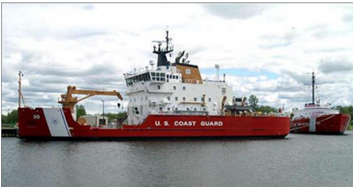
Figure E-1. Great Lakes Icebreaker Mackinaw