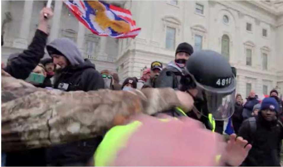
Gov't Ex. 16 (cropped).

to rejoin the larger group of withdrawing officers. Gov't Ex. 12, 16. Government Exhibit 16 shows the punch.