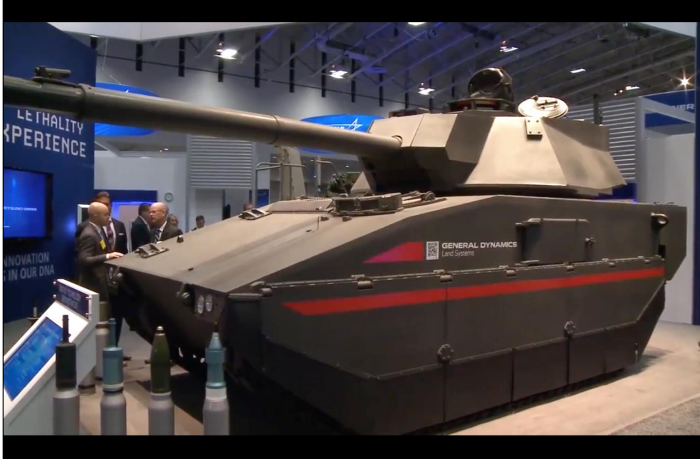
Figure 3. GDLS Griffin III Prototype

Source: Sydney J. Freedberg, “General Dynamics Land Systems Griffin III for U.S. Army’s Next Generation Combat Vehicle (NGCV),” October 8, 2018.