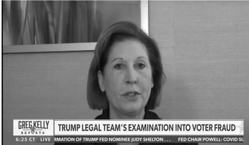
Compl. ¶ 181(k) (“Sidney Powell Trump Campaign Lawyer”):