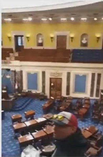
January 6, 2021 - Leo Brent Bozell IV on the U.S. Capitol Senate Balcony