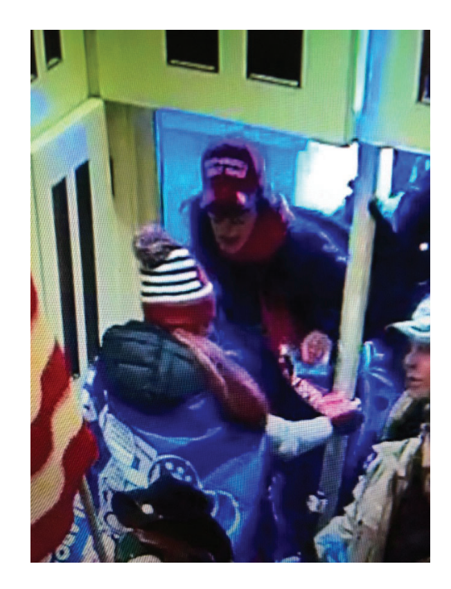
15. Based on the foregoing, your affiant submits that there is probable cause to believe that BANCROFT and SANTOS-SMITH violated 18 U.S.C. § 1752(a)(1) and (2), which makes it a crime to (1) knowingly enter or remain in any restricted building or grounds without lawful authority to do; and (2) knowingly, and with intent to impede or disrupt the orderly conduct of Government business or official functions, engage in disorderly or disruptive conduct in, or within such proximity to, any restricted building or grounds when, or so that, such conduct, in fact, impedes or disrupts the orderly conduct of Government business or official functions; or attempts or conspires to do so. For purposes of Section 1752 of Title 18, a "restricted building" includes a posted, cordoned off, or otherwise restricted area of a building or grounds where the President or other person protected by the Secret Service, including the Vice President, is or will be temporarily visiting; or any building or grounds so restricted in conjunction with an event designated as a special event of national significance.