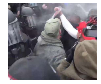
Figure 15. SAMSEL pulling on Riot Shield