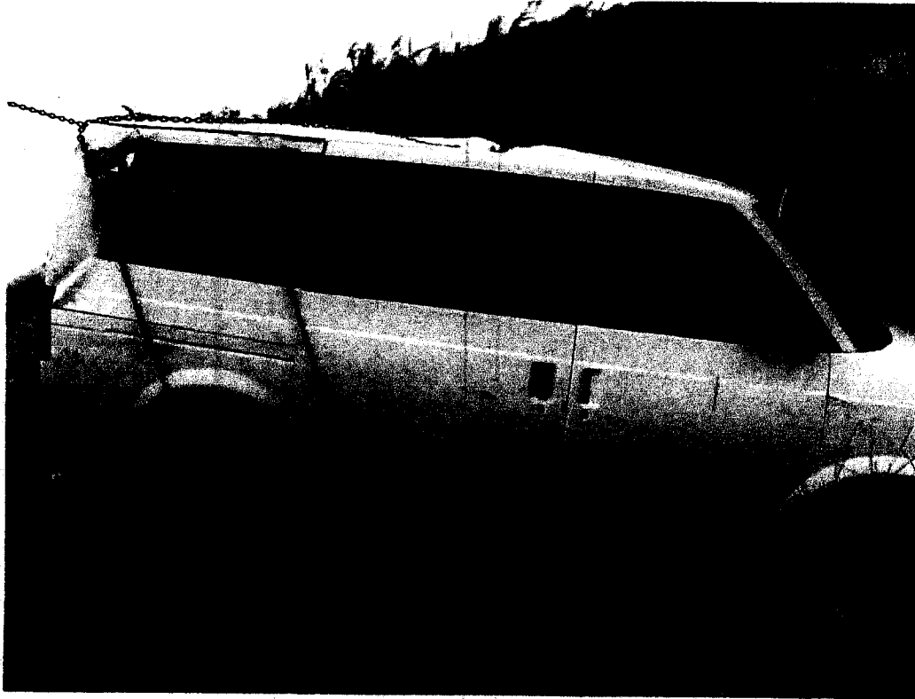
RIGHT SIDE VIEW OF ASTRO VAN