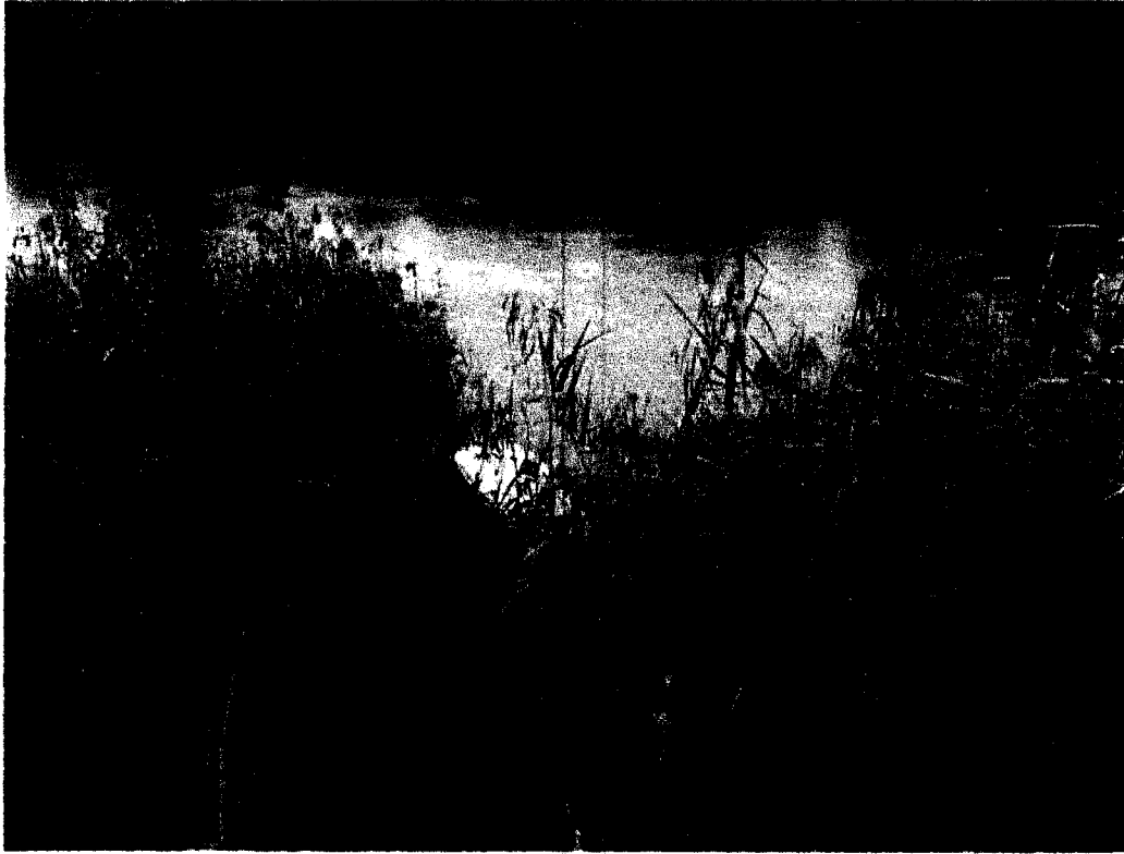
VIEW OF ASTRO VAN PARTIALLY SUBMERGED IN THE RIO GRANDE RIVER