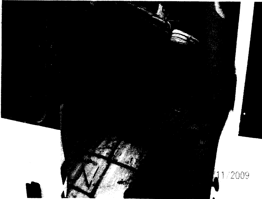
VIEW OF MARIHUANA BUNDLES INSIDE ASTRO VAN