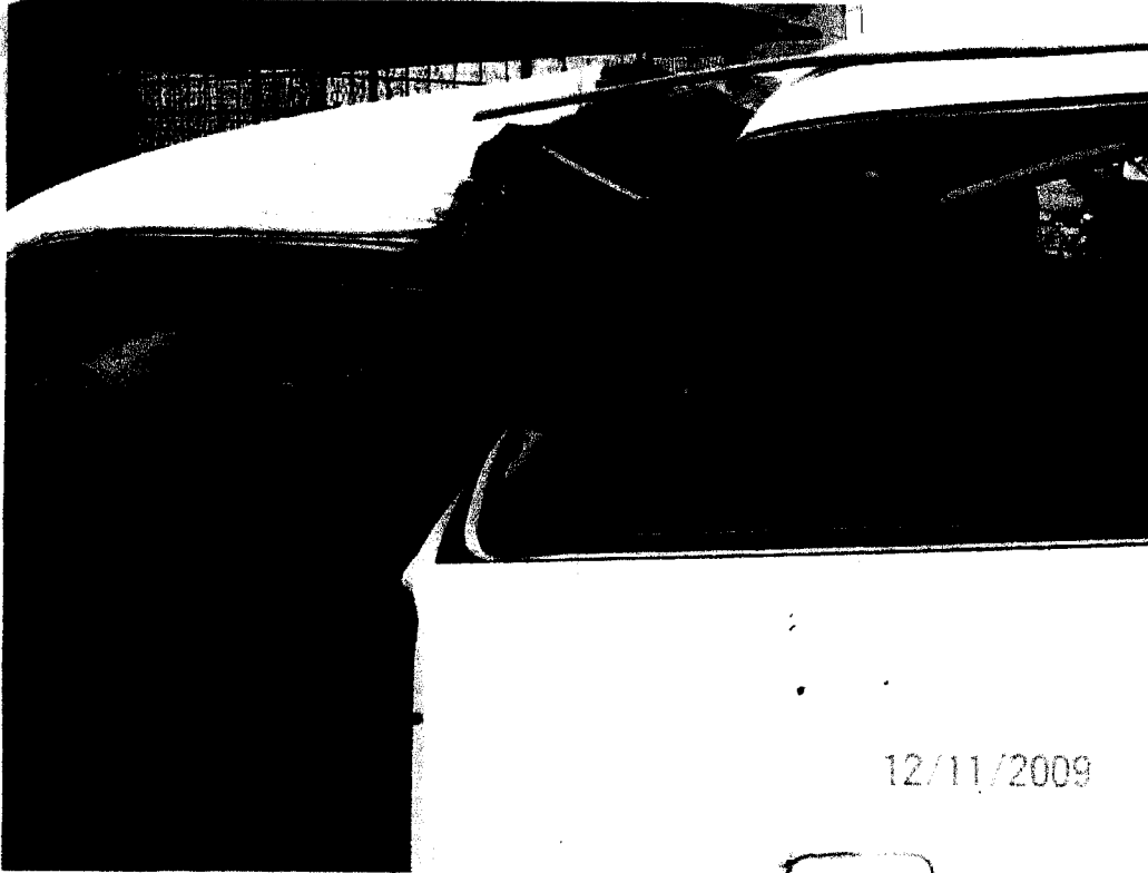
LEFT FRONT VIEW OF ASTRO VAN