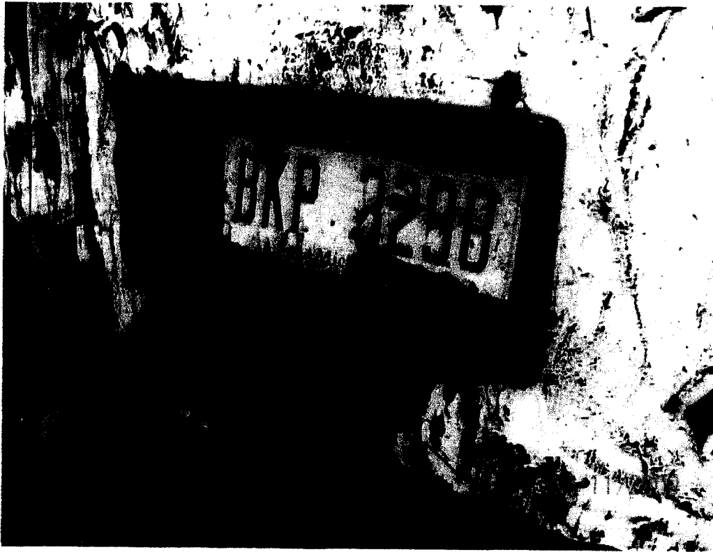
VIEW OF FICTITIOUS MICHIGAN LP