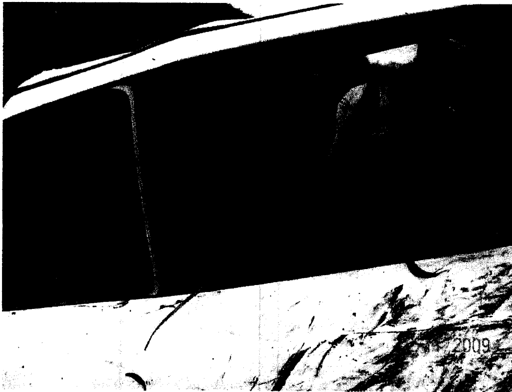
VIEW OF MARIHUANA BUNDLES INSIDE OF ASTRO VAN