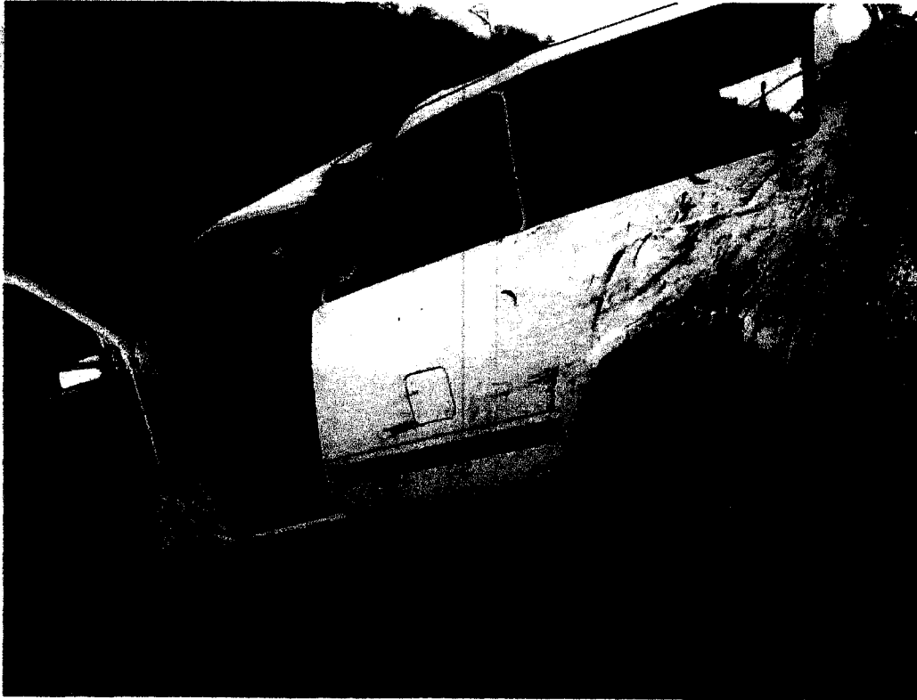
LEFT SIDE VIEW OF ASTRO VAN