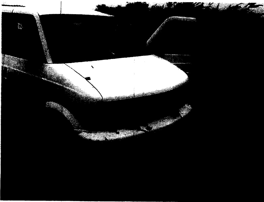
FRONT VIEW OF ASTRO VAN