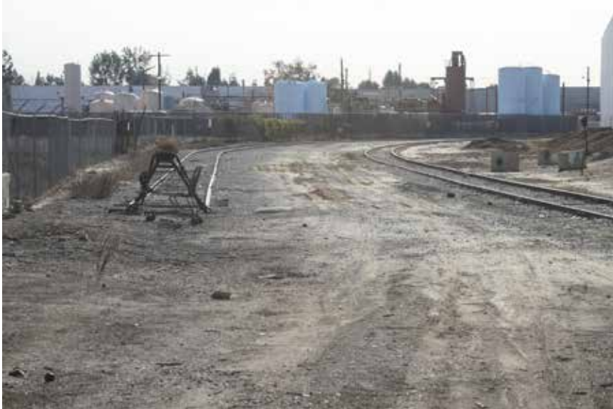
The Phibro-Tech facility in Santa Fe Springs

DTSC’s enforcement at Phibro-Tech has been “lethargic.” The company engaged in “Kafkaesque” stalling, pleaded that it couldn’t afford to pay for permit renewal and corrective action, and delayed the permitting process by requesting to add a new waste stream, oily water. DTSC allowed the company to switch its strategy for cleaning up hexavalent chromium