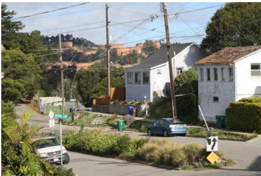
Point Richmond residents' view of tanks on the edge of the Chevron refinery

For one, Chapter 6.8 of the Health & Safety Code, which gives the department its most extensive authority in ordering cleanups, specifically excludes petroleum products from its definition of hazardous substances.