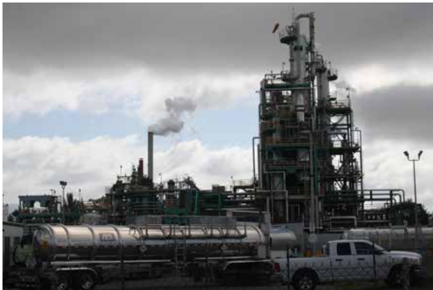
The Evergreen Oil plant in Newark

ALLEGATIONS: DTSC has issued only “wrist-slap fines” totaling $86,000 against Newark oil recycler Evergreen Oil despite the company being “a serial violator of environmental laws.” Industrial accidents and odors at Evergreen have plagued neighbors. Yet DTSC has abdicated its