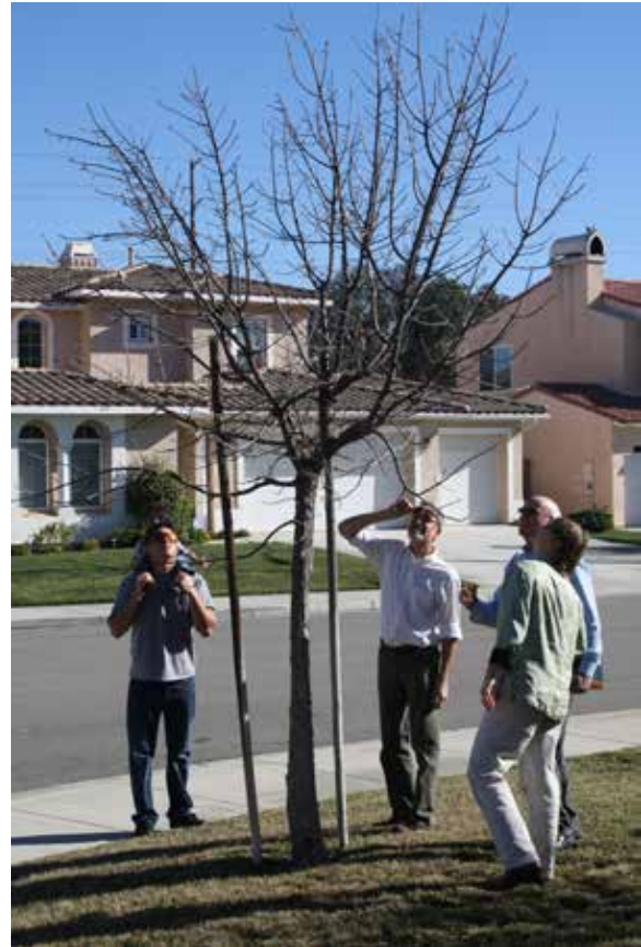
State officials and Autumnwood residents examine a dead tree in the subdivision that residents believe may indicate the presence of toxic contamination