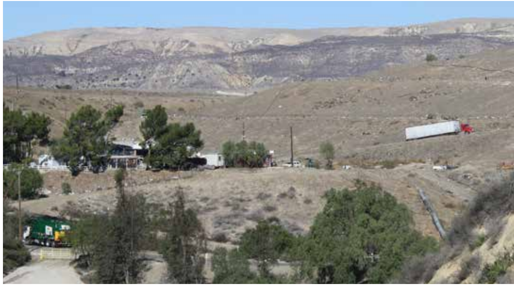
A truck carrying “auto fluff” to be deposited at the Simi Valley Landfill

For some time, metal recyclers stockpiled waste on-site. Then, with the help of a UC Berkeley chemical engineer, the industry developed a treatment process to reduce the amount of metal that would leach out of shredder waste in landfills. The toxics division of the Department of Health Services determined that if recyclers used this process as a standard part of the recycling operation, shredder waste could be considered non-hazardous under California regulation.