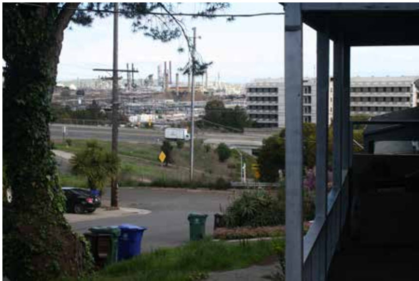
The Chevron refinery is just across the freeway from homes in Point Richmond

In addition, more than a decade ago, DTSC backed down from an initiative to profile all the state’s refineries – as a first step in taking the lead in regulating refineries – when the industry objected, citing post-9/11 security concerns.