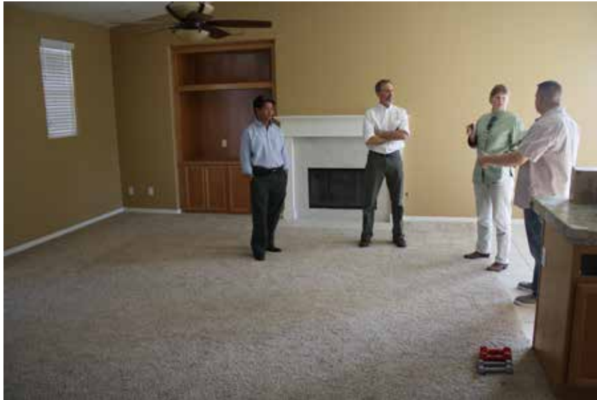
State officials and Autumnwood residents discuss potential contamination in a house abandoned by its owners

our office, DTSC did not explain why its toxicologist and others within the department reached a conclusion at odds with their counterparts at other state entities.