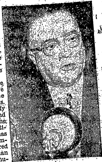
J. EDGAR HOOVER

it, by the American people; it seems to us is one of sensible detachment rather than blindness and lethargy.