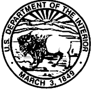
EXHIBIT K Science Summary FOIA Appeal Decision

FOIA Appeal No. 2014-007 IN REPLY REFER TO.