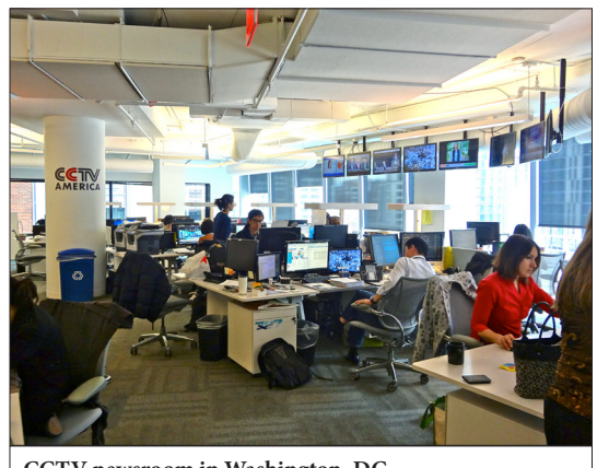
CCTV newsroom in Washington, DC.

In the meantime, who's watching? The answer is not entirely clear, since no reliable rating systems appear to be in place. Much of the language applied to CCTV's audience is misleading, intentionally or otherwise. In 2009, for example, the South China Morning Post reported, "CCTV says its channels reach 838 million overseas subscribers in 137 nations." But "reaching subscribers" can be a different metric than "viewership": Manhattan's Time-Warner