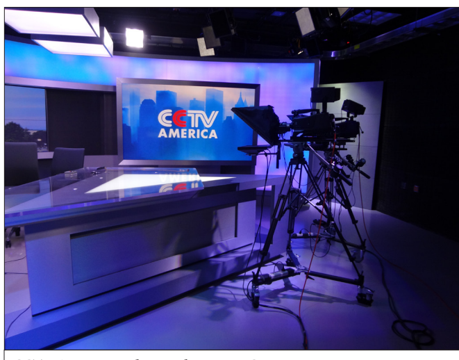
CCTV America studio, Washington DC

Sharp, young reporters and producers peer into their screens in the vast, light-filled newsroom. In one area of the facility they generate stories in English; in another, in Chinese. The English-language staff has gravitated to CCTV from world-class news organizations—including ABC, CBS, CNN International, and the BBC—working