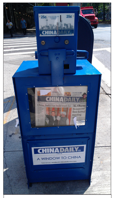
The China Daily for sale in New York City

Zhang reported that CCTV based its work on the central government's "2009-2020 Master Plan for the Construction of China's Major Media as an International Dissemination Force."