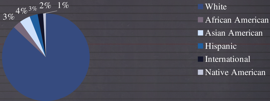
TCU Student Body Composition By Race