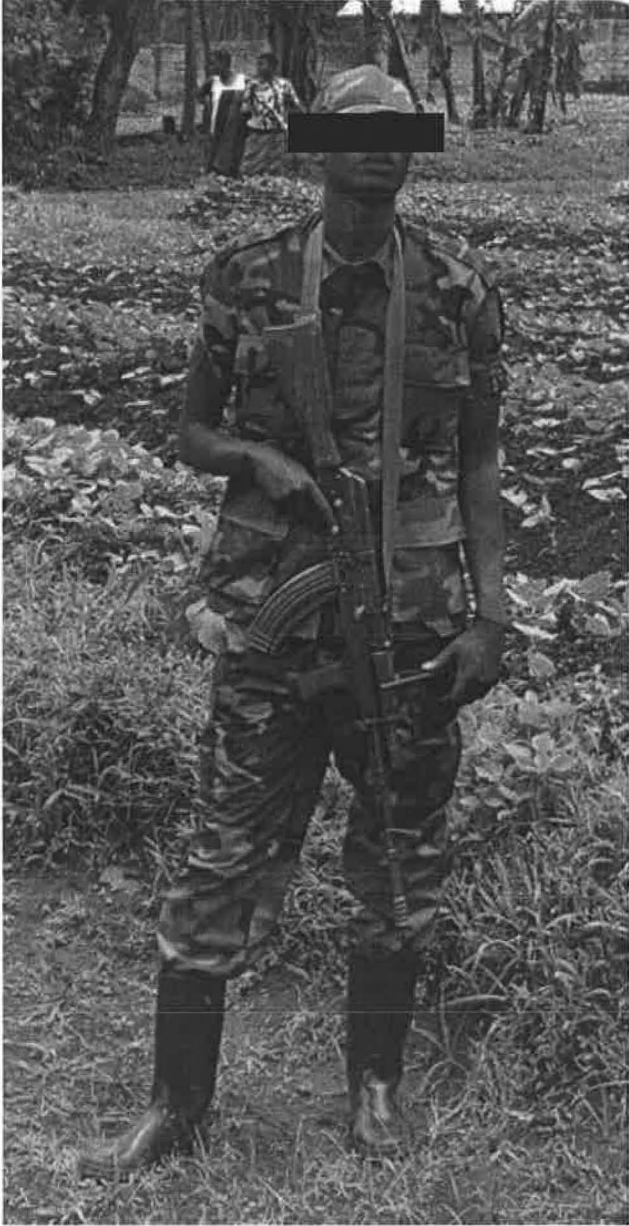
An RDF soldier seen by the EJVM in Rutshuru on 1 November