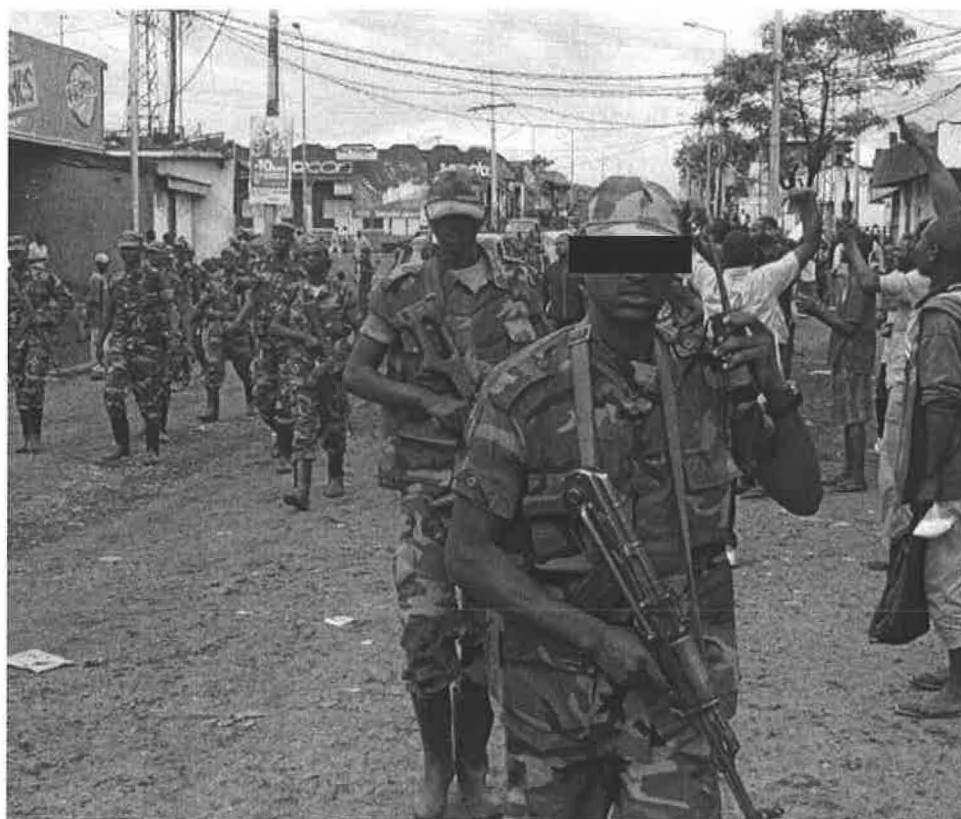
Photo of M23 soldiers arriving to Goma wearing RDF uniforms.