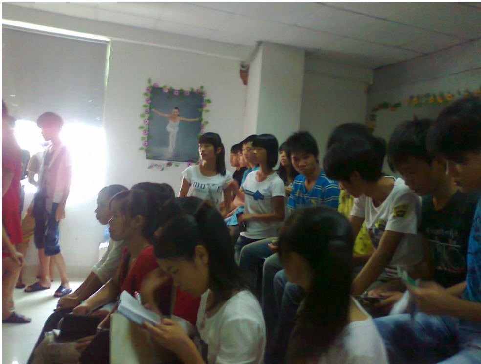
Student workers and child workers from vocational schools

Apart from child labor abuses, there are also significant defects in the management and remuneration of student laborers at HEG. Based on our investigation, the schools providing student workers to HEG in the long-term are Hunan Yuandong Vocational and Technical School, Chongqing Fuling Informational and Technical School, Guizhou Tongren Yanhe Secondary Vocational School , Chongqing Qijiang Vocational and Technical School, Guangdong Zhanjiang Chengyue Electronic School, Guangdong Zhanjiang Leizhou Sixth Middle School, Guangdong Zhanjiang Taiping Third Middle School, and Guangdong Huazhou Yangmei Middle School, and others.