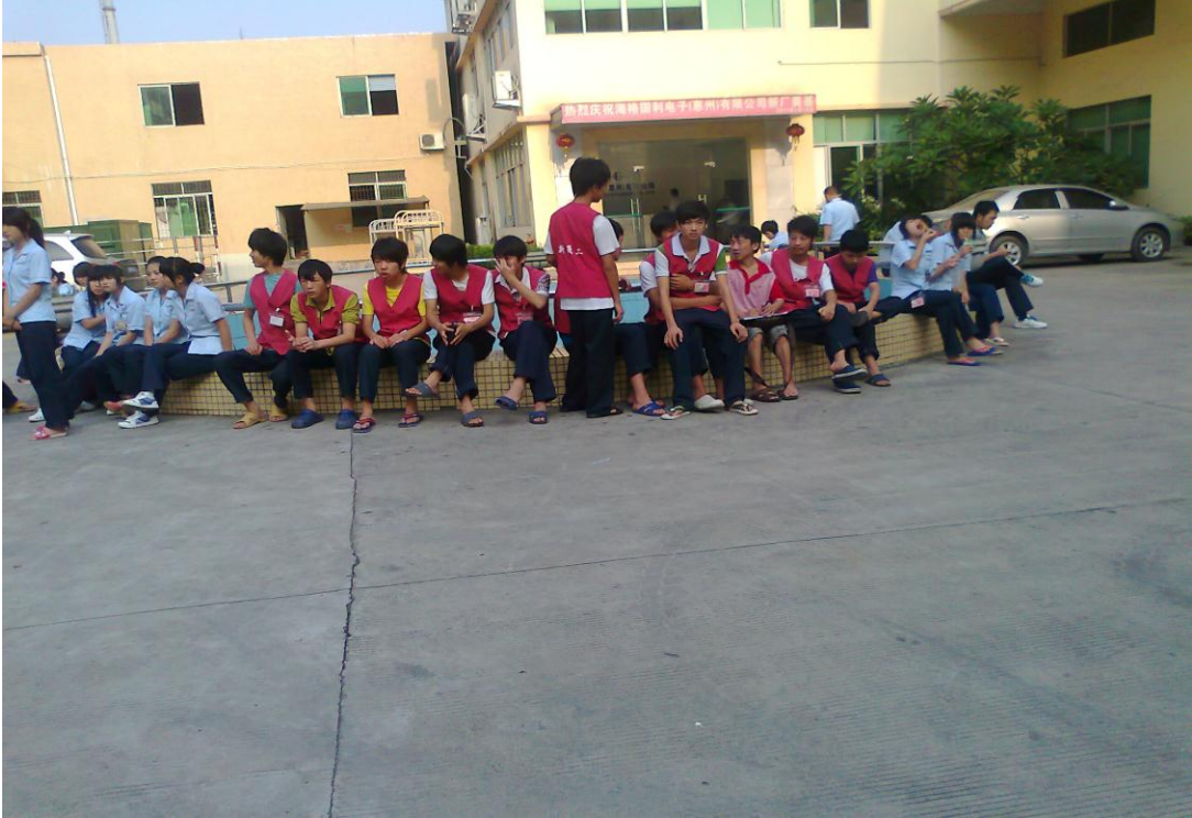
Student workers and child workers during break time