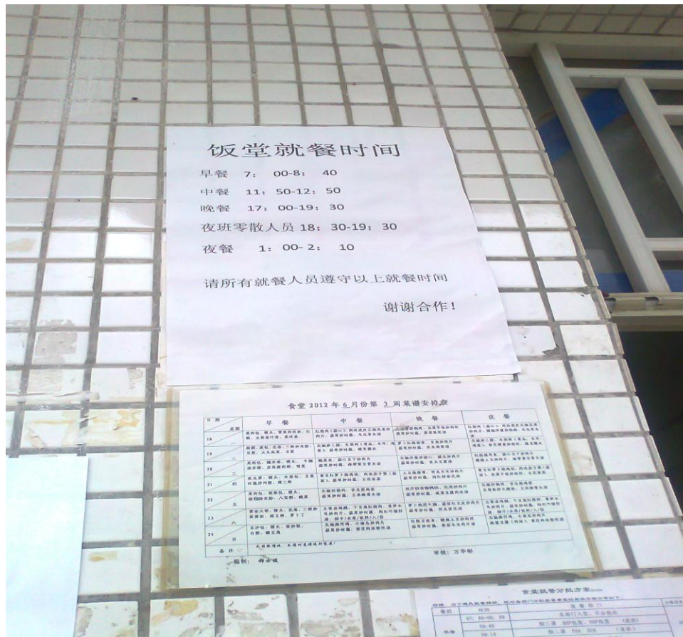
Timetable for meals