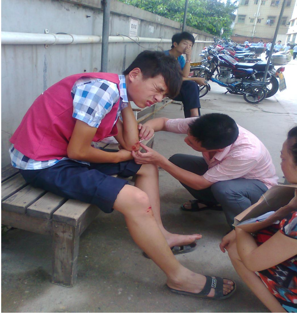
A worker injured on the job

The main chemical that workers are exposed to while working is ethyl alcohol. They only have one opportunity per day to get new protective gloves from the supervisor if the gloves are worn out. Everyday, during the rushed period of shift changes, the workshops became very hot. Many employees want to resign because they could not tolerate high-temperature environment. If the supervisor refused their request to resign, they would just simply leave. Each workshop is equipped with a “environmental temperature/humidity control chart”. However, the chart is not created based on real conditions. The chart is written within standard range so that the company could pass an audit.