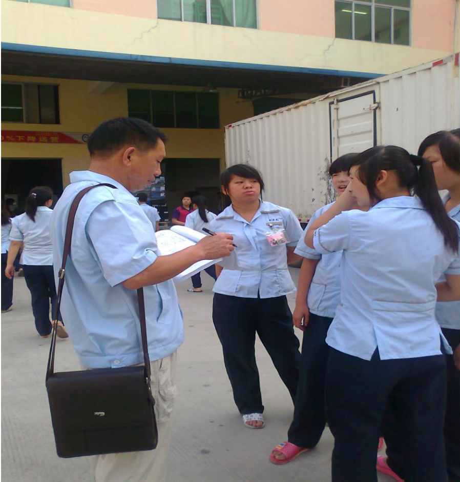
The teacher instructing students on intern issues