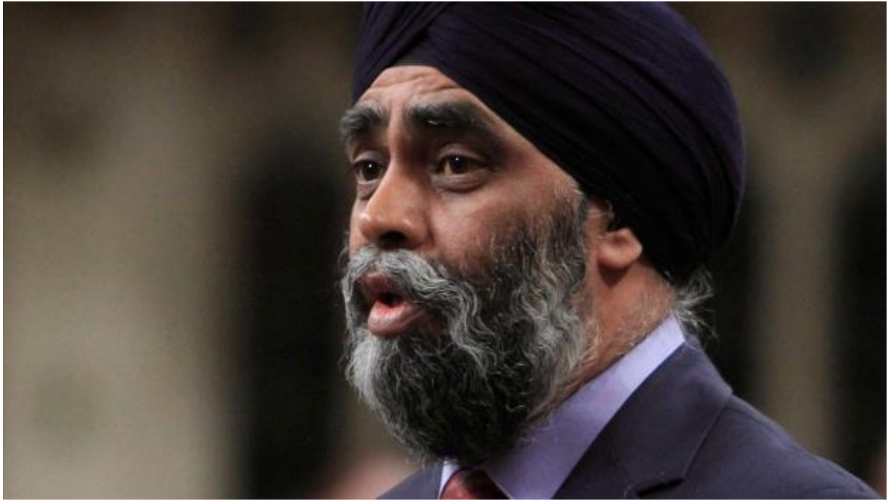
Canadian Defence Minister Harjit Sajjan

Canada's Defence Minister, Harjit Sajjan, had an interesting career before entering politics. He worked as a detective for the Vancouver Police Department. He was also a commander in the Canadian Armed Forces. During his time in the army, Sajjan did tours in Afghanistan. Last month, Sajjan spoke at a conference in India about peacekeeping. He said that he had a very important role in a big 2006 military operation called Operation Medusa. This news was reported in Canadian media. Sajjan is now being criticized for not telling the truth about his role in Medusa.