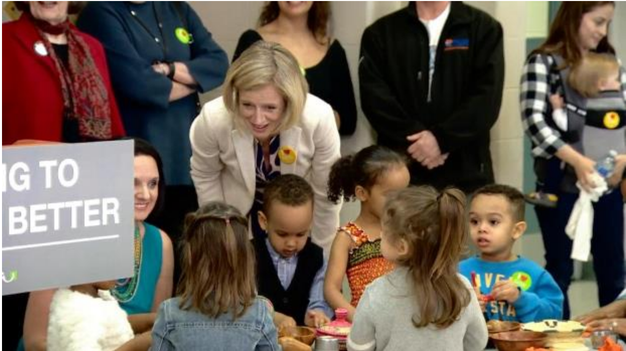
Alberta Premier Rachel Notley visits the Intercultural Child and Family Centre in Edmonton

For many Canadian families, daycare is a concern. Across the country, families struggle with daycare options for their young children. In many places, there aren't enough daycares to serve all the families in a community. Also, daycare facilities can be very expensive, especially for families who don't have much extra money. This issue is a concern for city, provincial and federal governments. Alberta recently announced a $25-a-day daycare option in the province. This plan is supposed to help families who struggle with daycare costs. It will also create new jobs in Alberta.